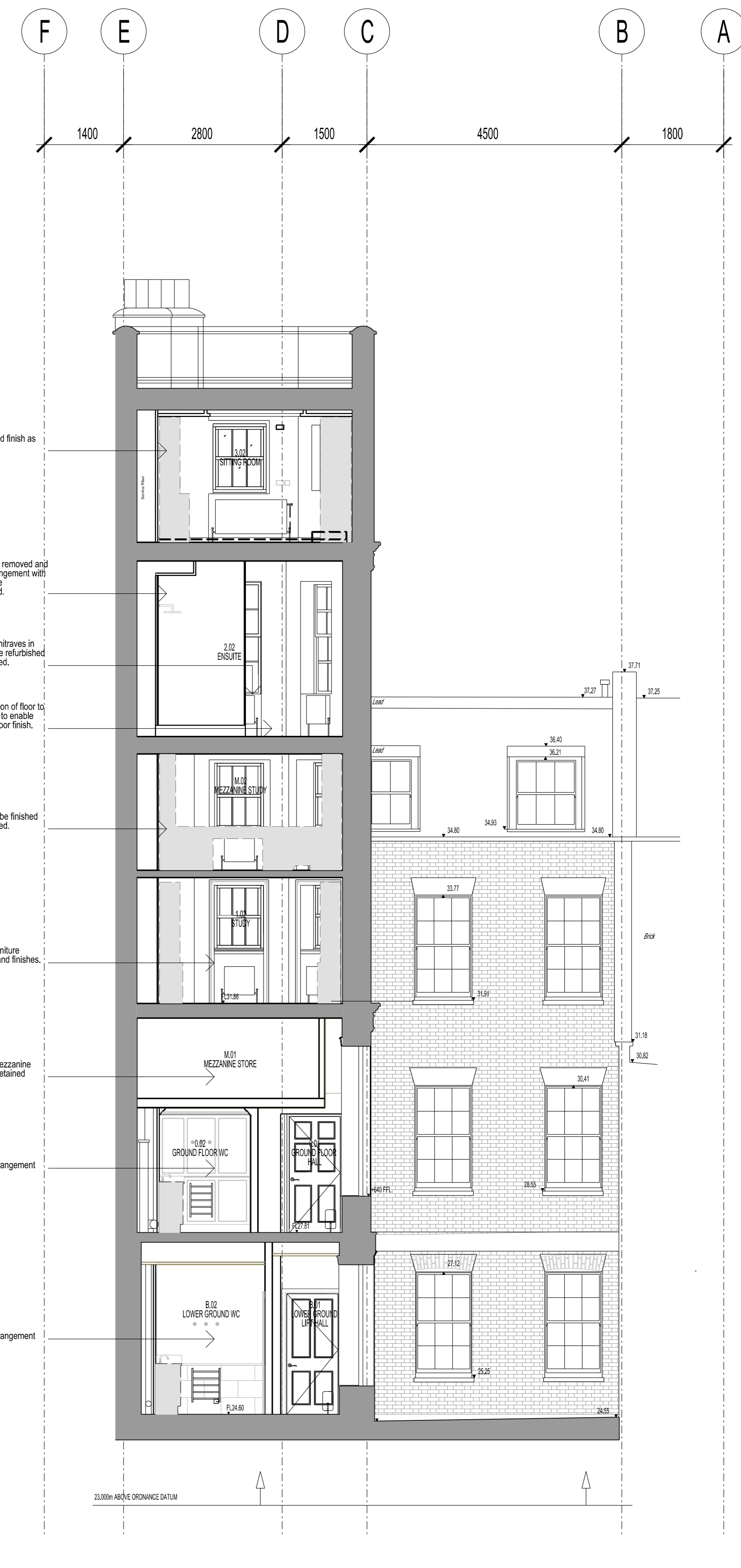
SECTION O - O

Rev D: Raised plasterboard ceiling. 3.031 Raised plasterboard ceiling.