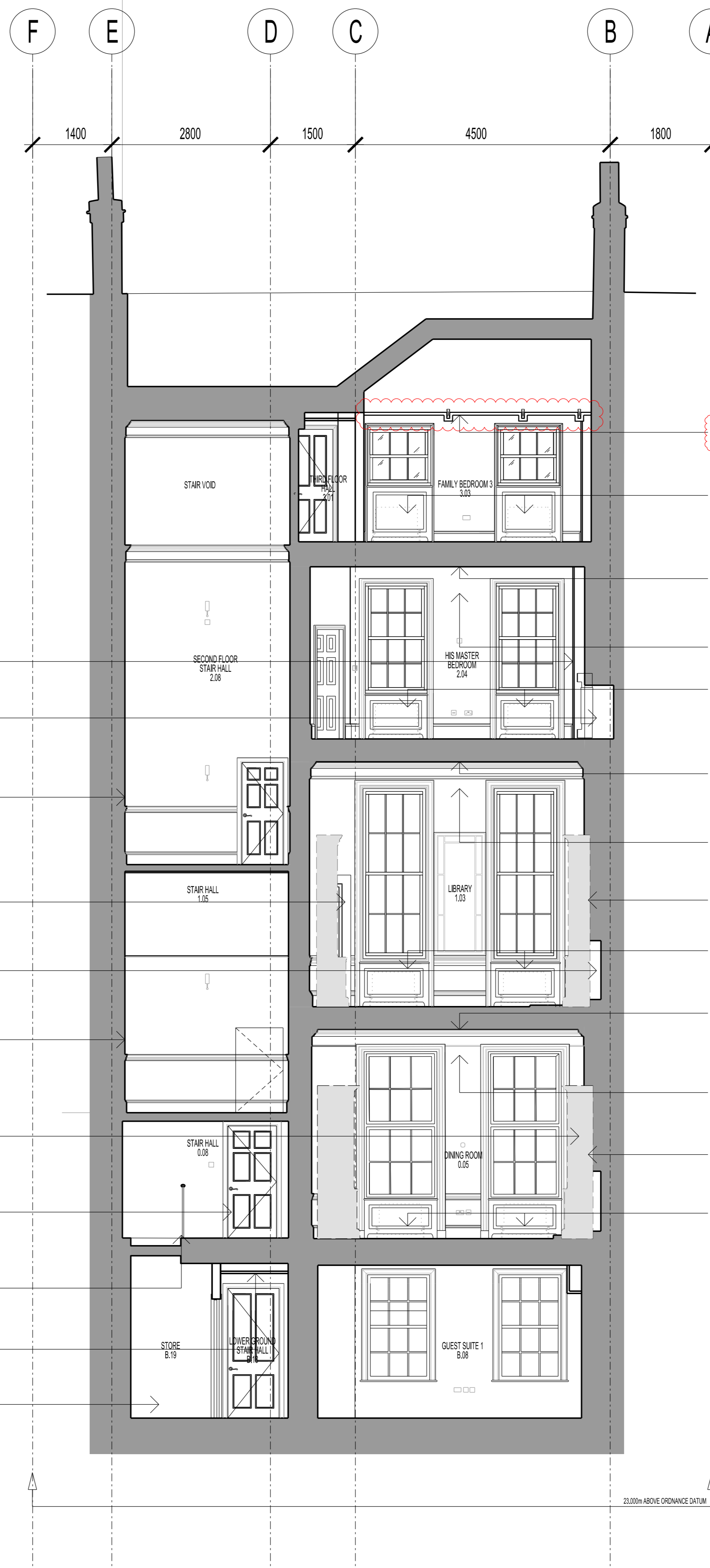
SECTION N - N