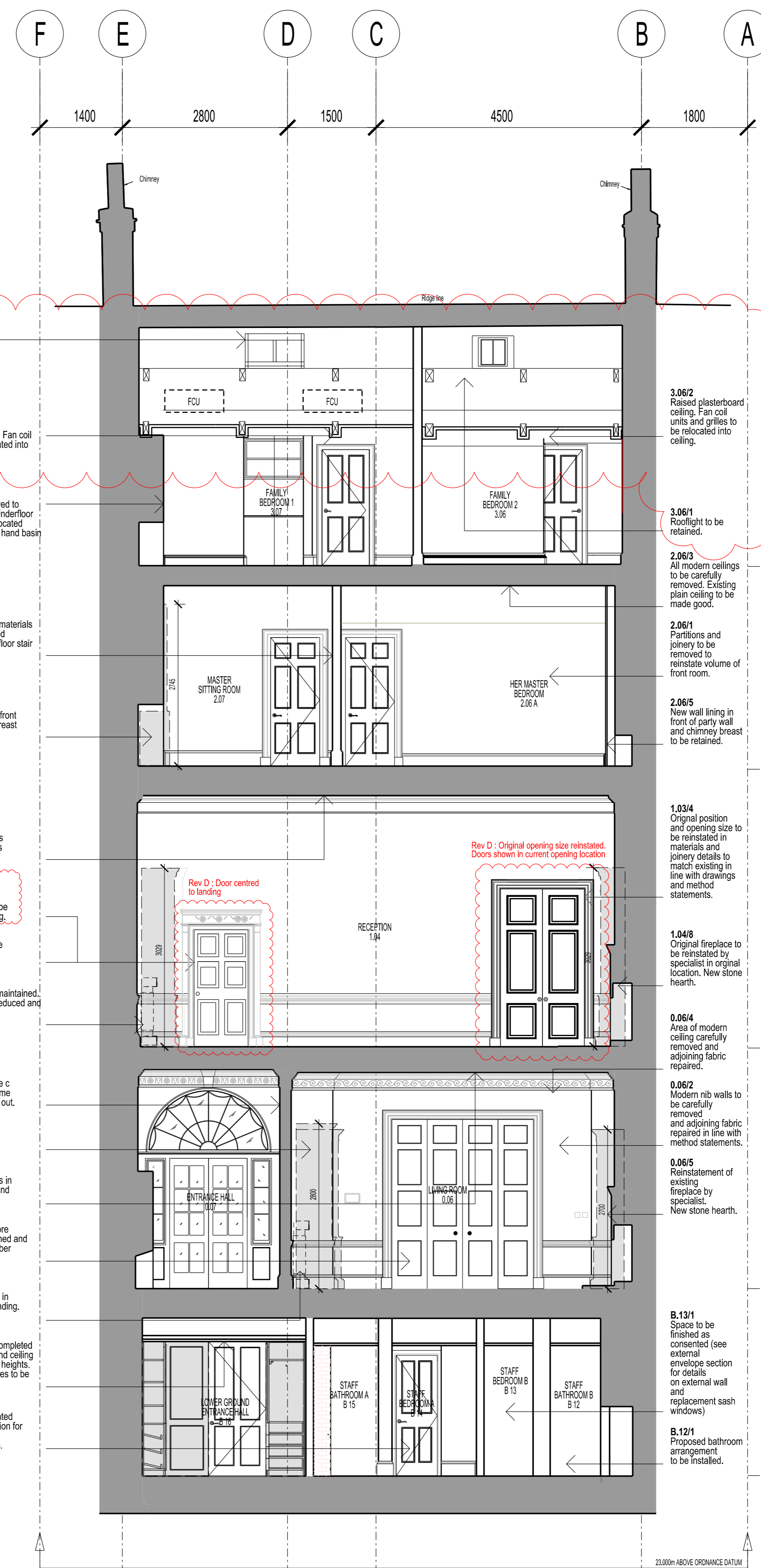
SECTION L - L