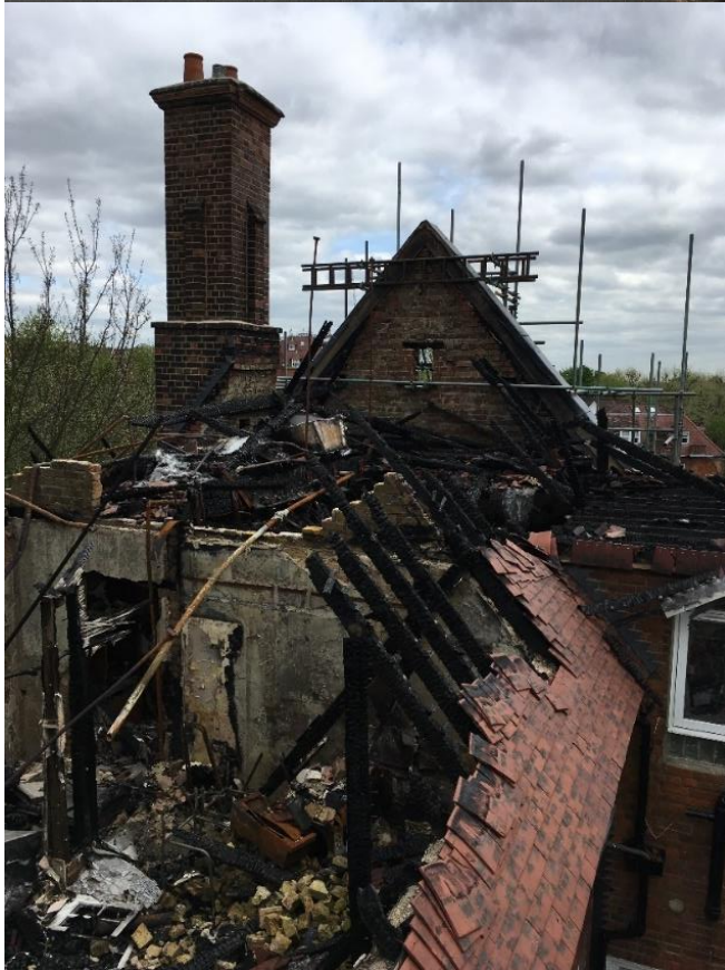
View from Roof Level