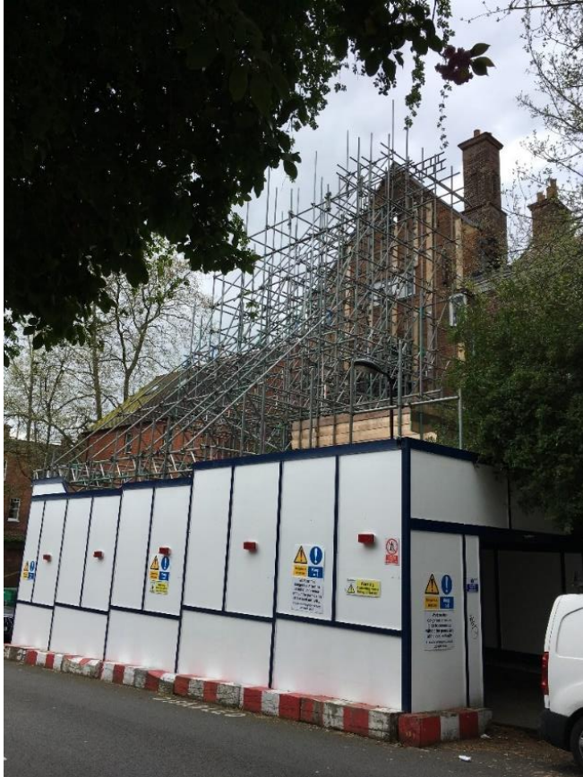
View from Daleham Gardens