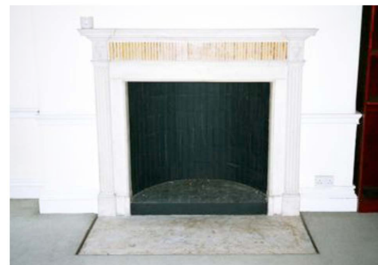
PICTURE 3 at Conservation Plan by Murray John Architects (prior 2011) Reproduction to be specified by specialist.