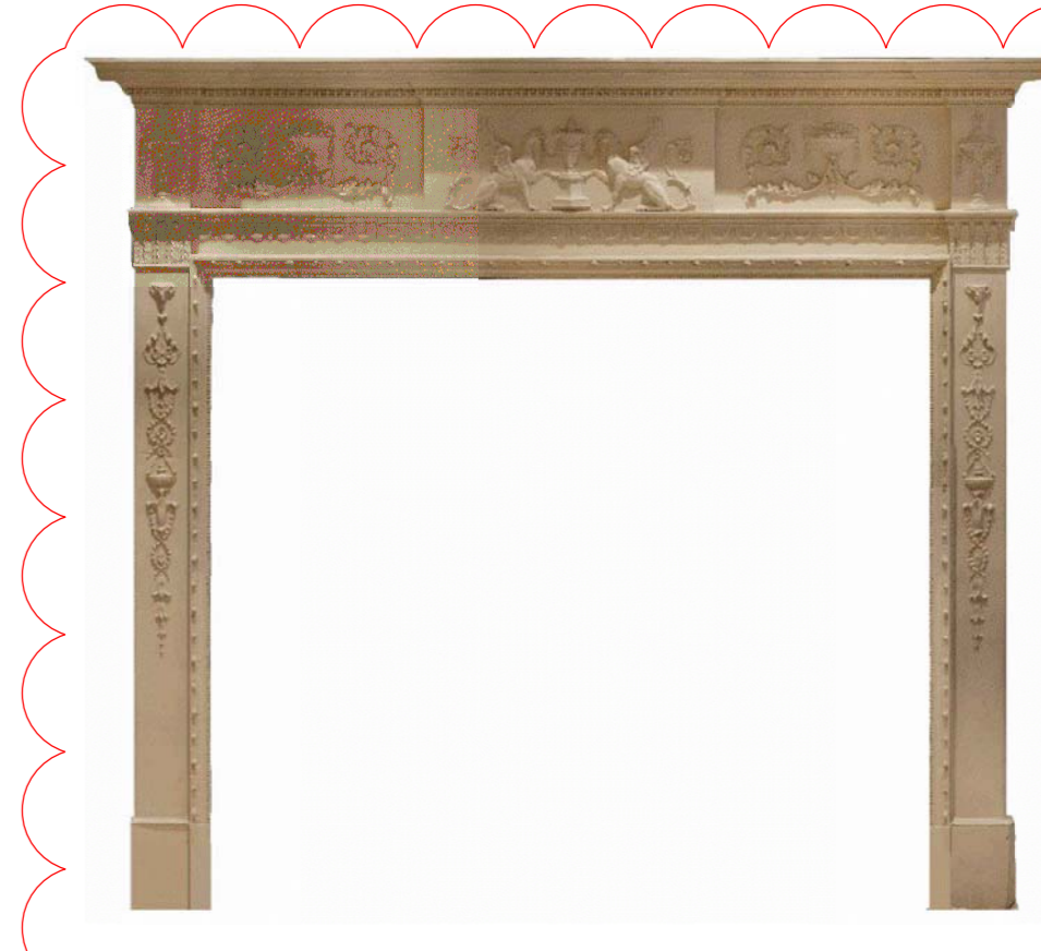
PICTURE 7 18th Century Pine & Plaster chimney piece purchased from Lasso Reclamation in London.

The original chimney piece was lost prior to current owner purchasing the building. Our consent allowed for the reproduction chimney piece however through discussions with the Conservation Officer it was agreed that this reclaimed chimney piece would make an adequate substitute.