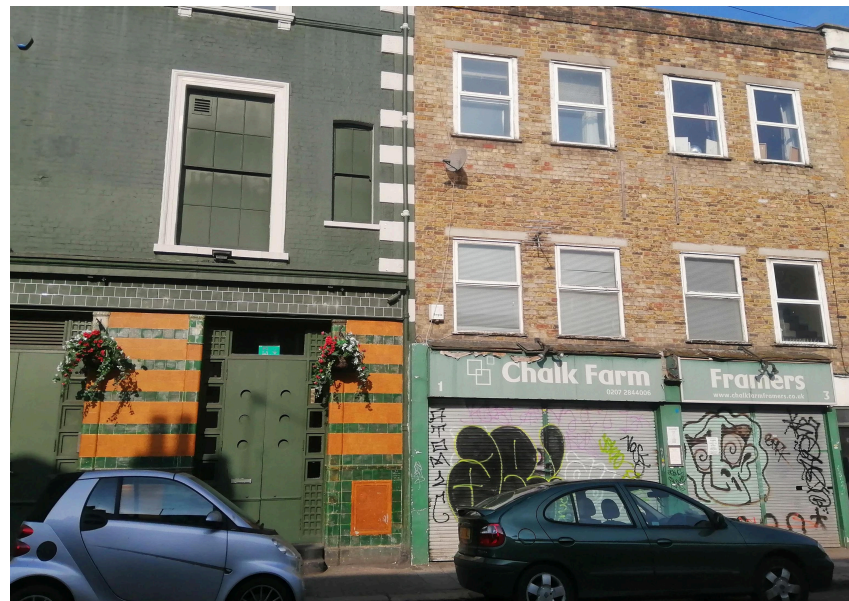
LOCATION B WITHOUT POLE

A 5.5m high, 76dia pole at the rear of the footpath approx 250 to the left of the high level floodlight with a filament crossing Ferdinand Street to a matching pole centred on the green pier at the left hand end of the shop premises.