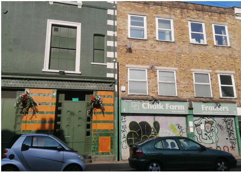
LOCATION B WITH POLE