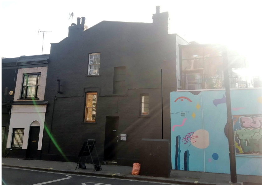
LOCATION A WITH POLE

A 5.5m high, 76dia pole at the rear of the footpath approx 250 to the left of the high level floodlight with a filament crossing Ferdinand Street to a matching pole centred on the green pier at the left hand end of the shop premises.