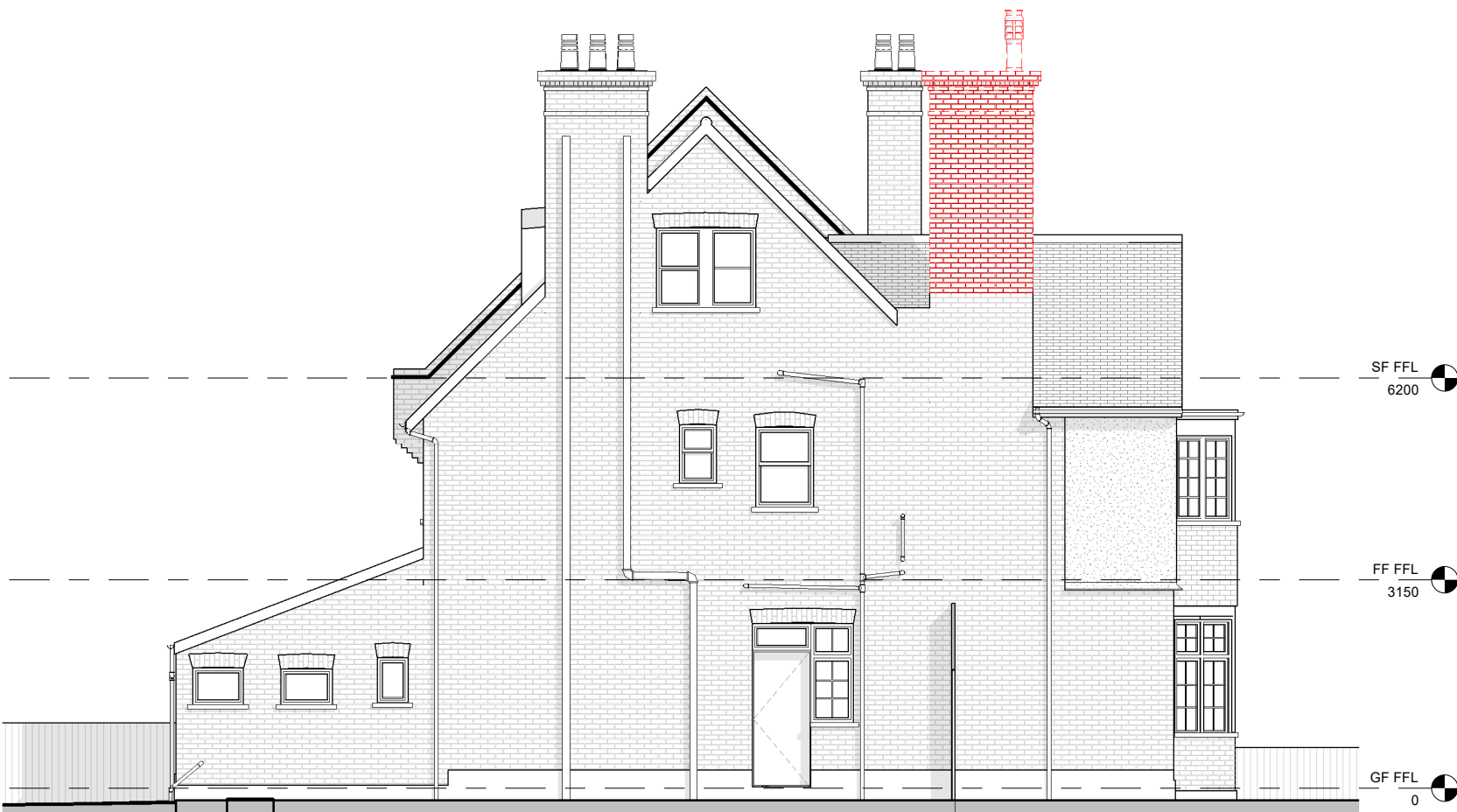
2 Demolition - Side Elevation 1 : 50