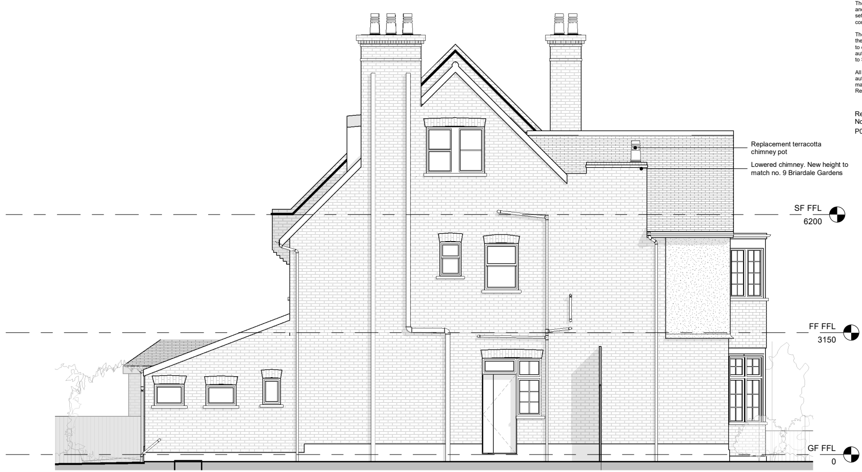
2 Proposed Side Elevation 1 : 50