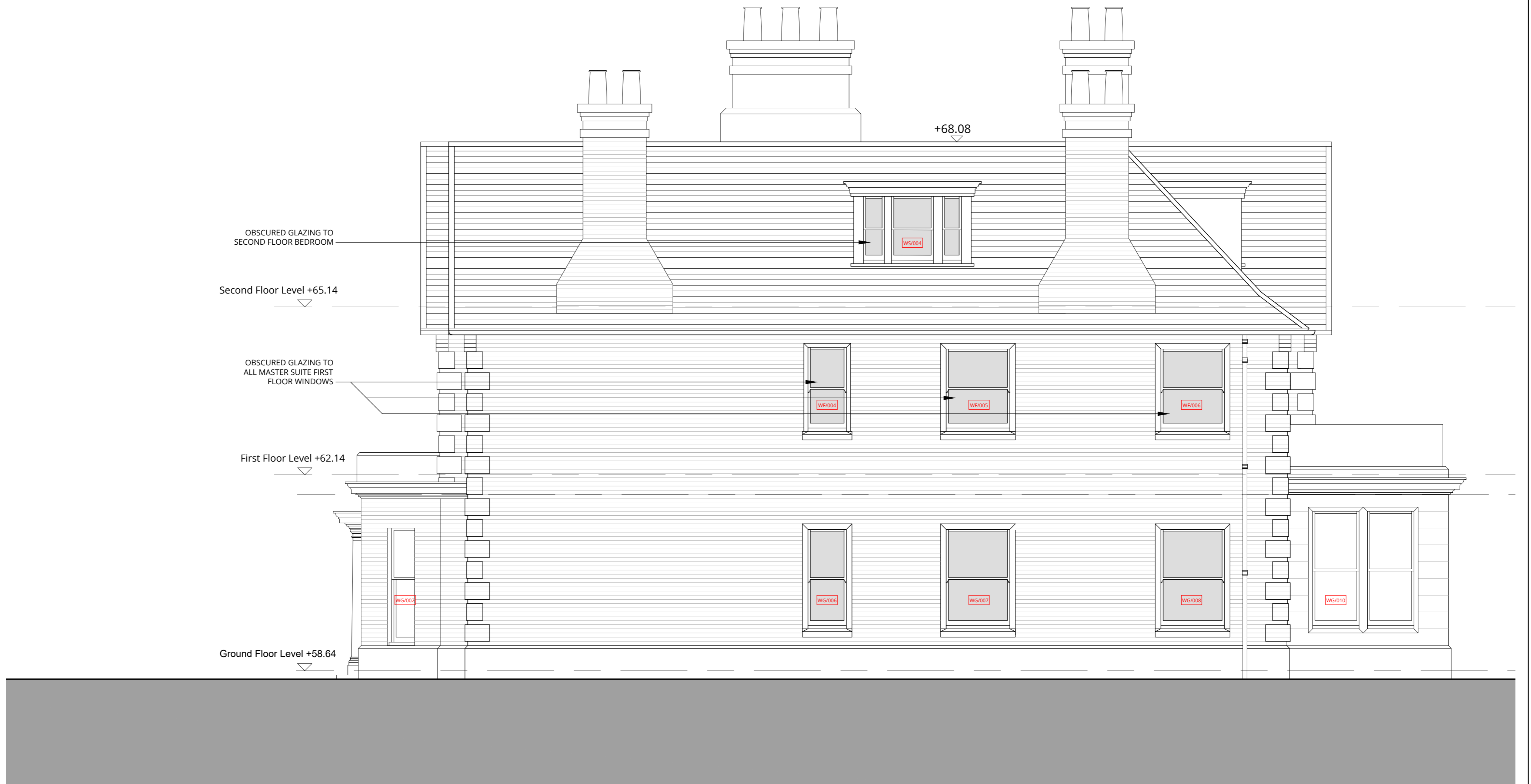
Consented Flank Elevation Scale 1:50