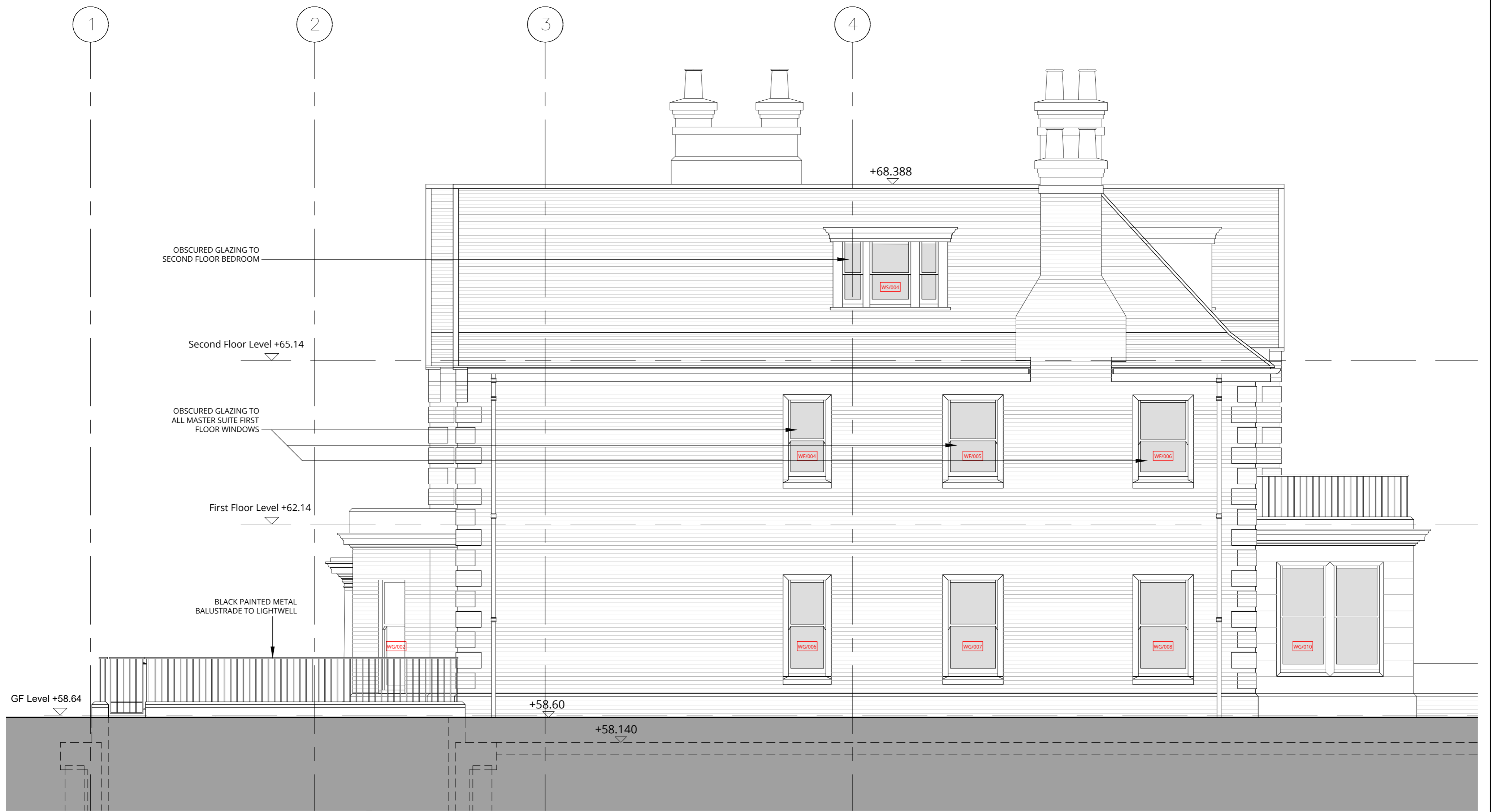
Proposed Flank Elevation Scale 1:50