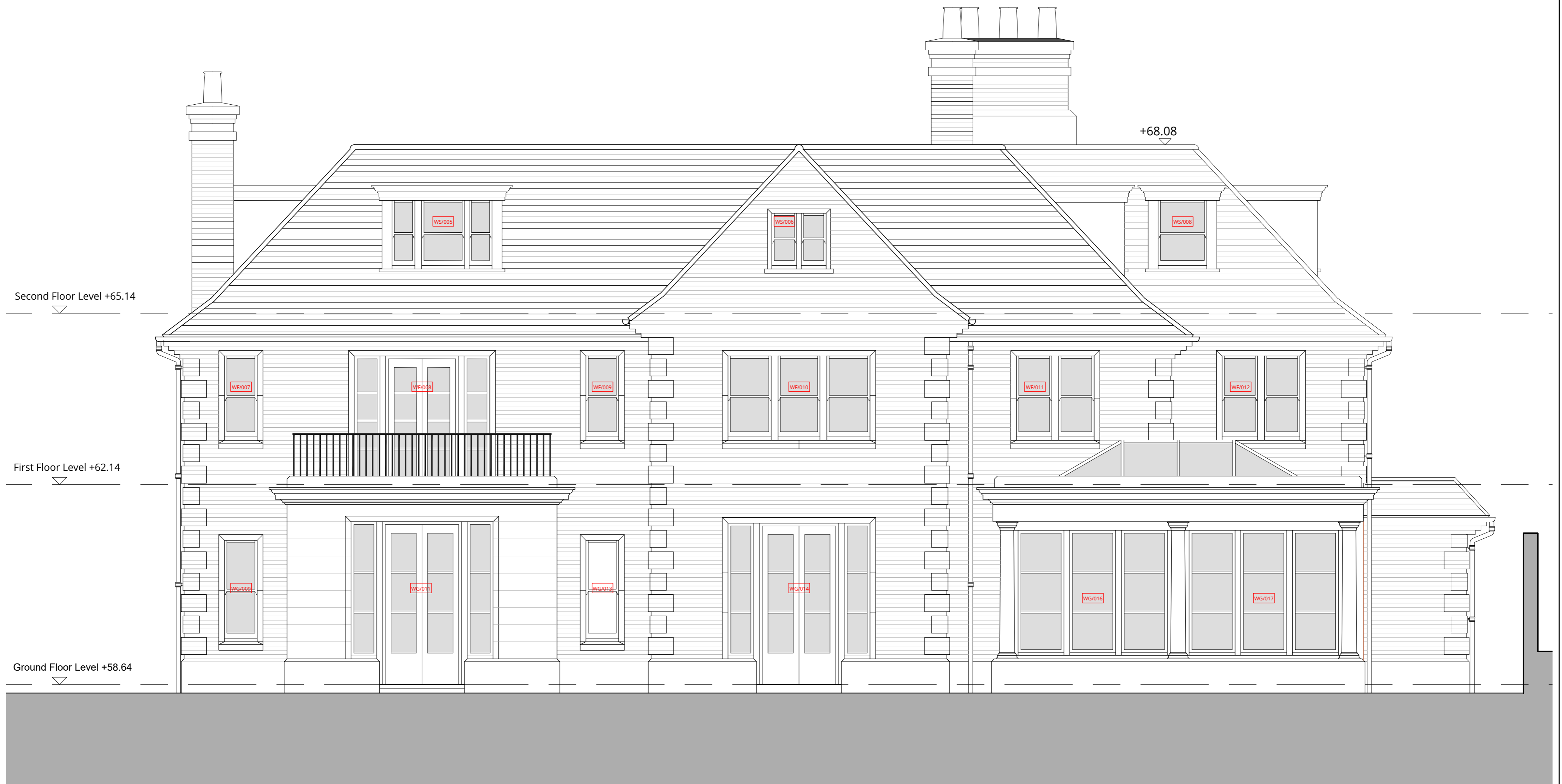
Consented Flank Elevation Scale 1:50