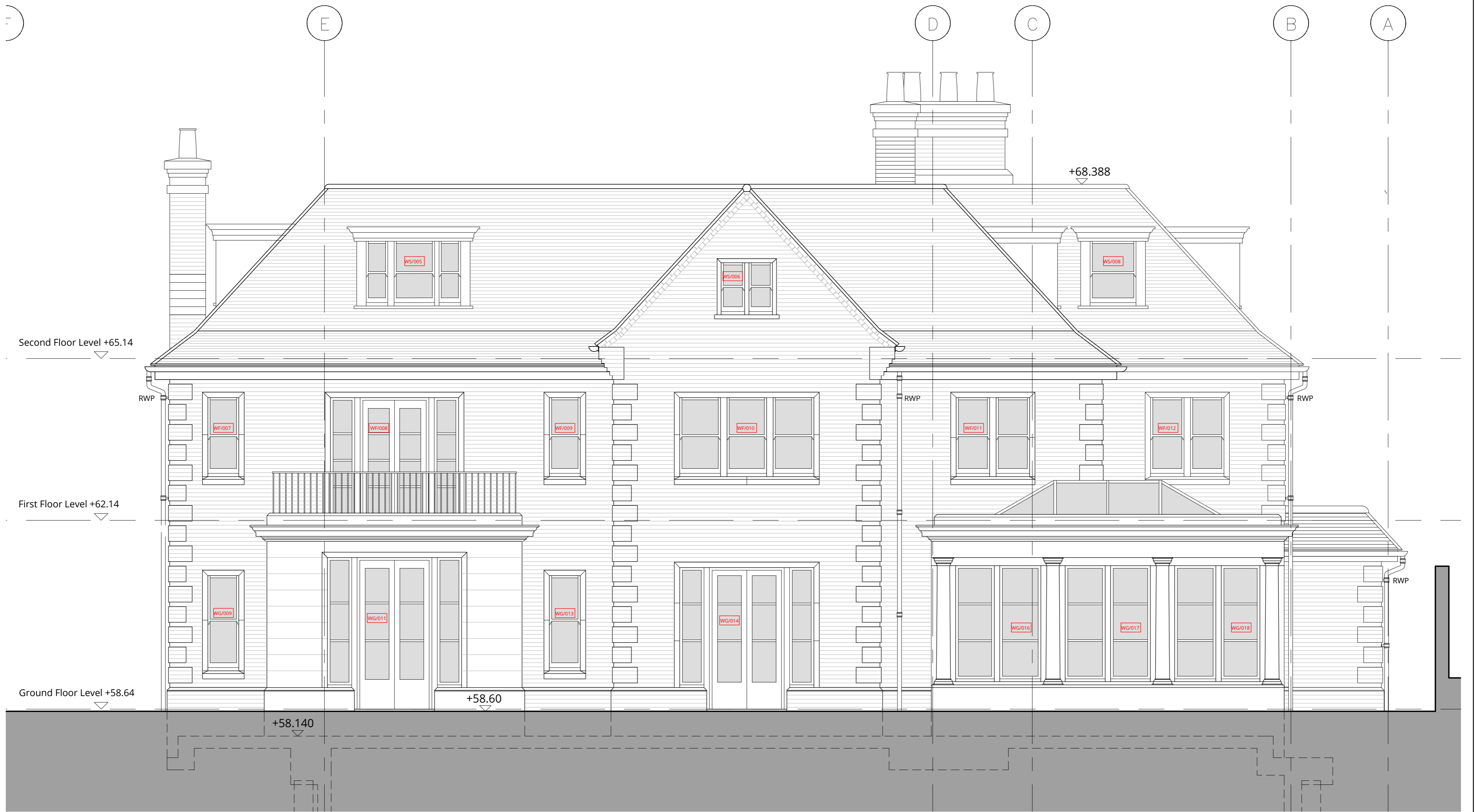
Proposed Flank Elevation Scale 1:50