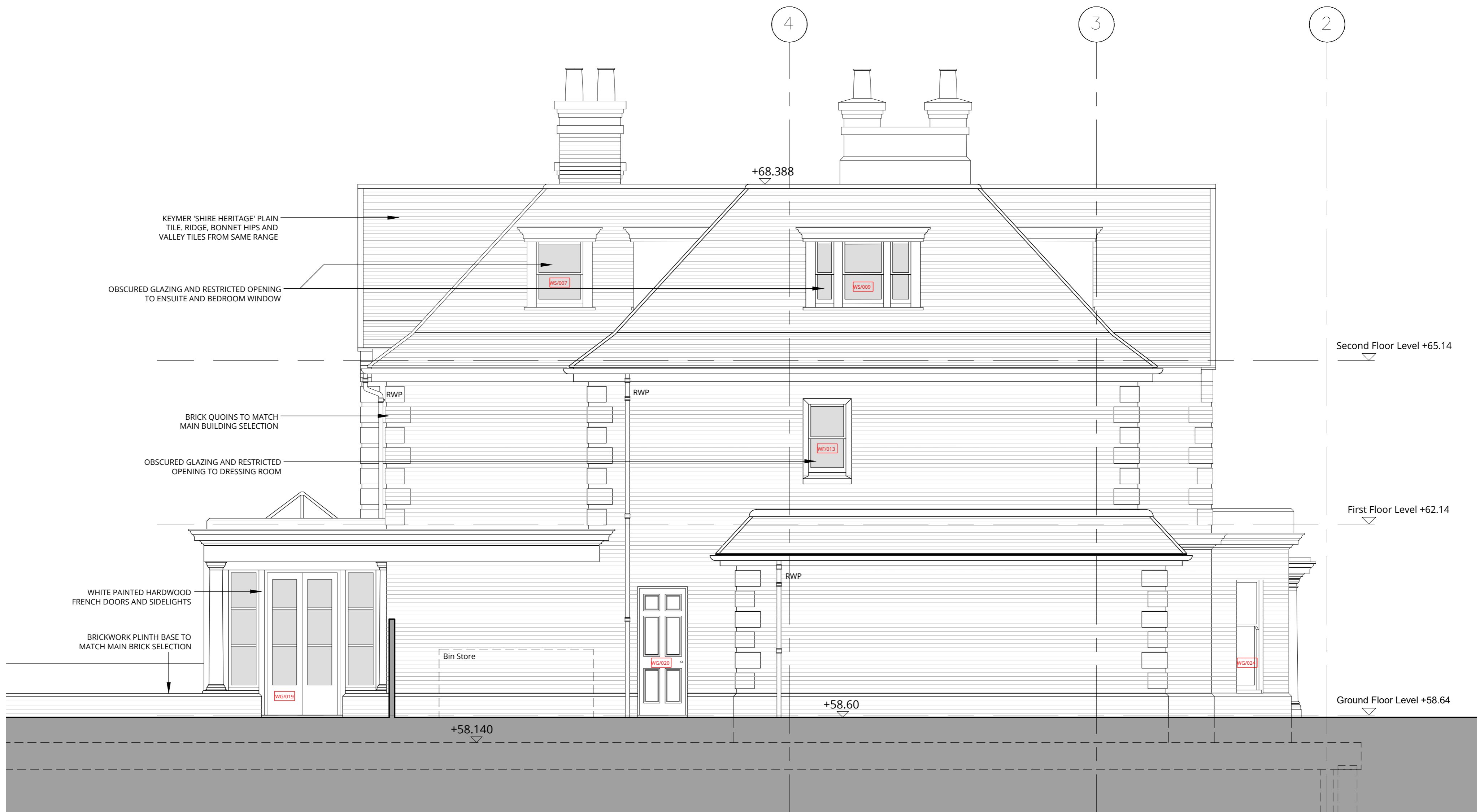
Proposed Flank Elevation Scale 1:50