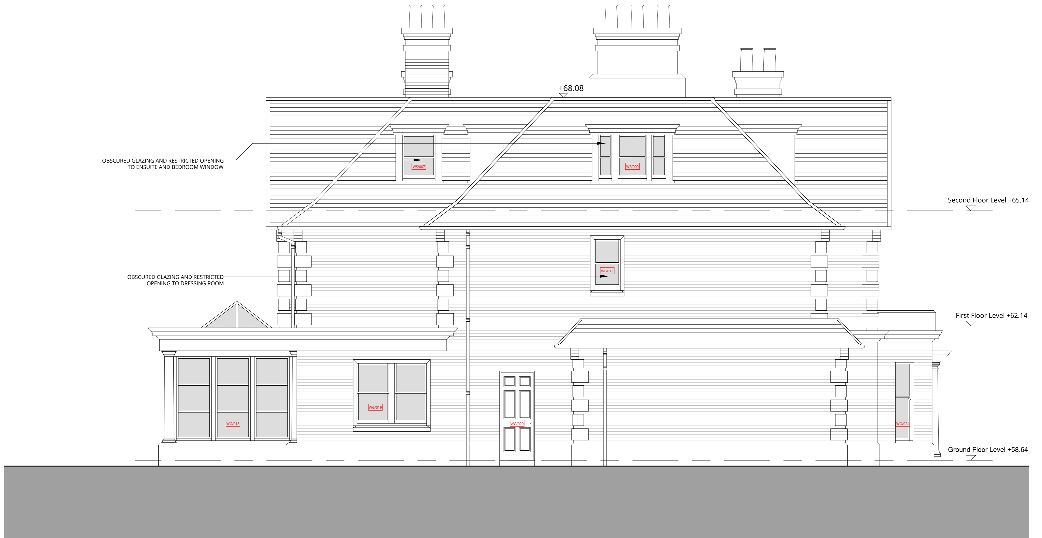
Consented Flank Elevation Scale 1:50