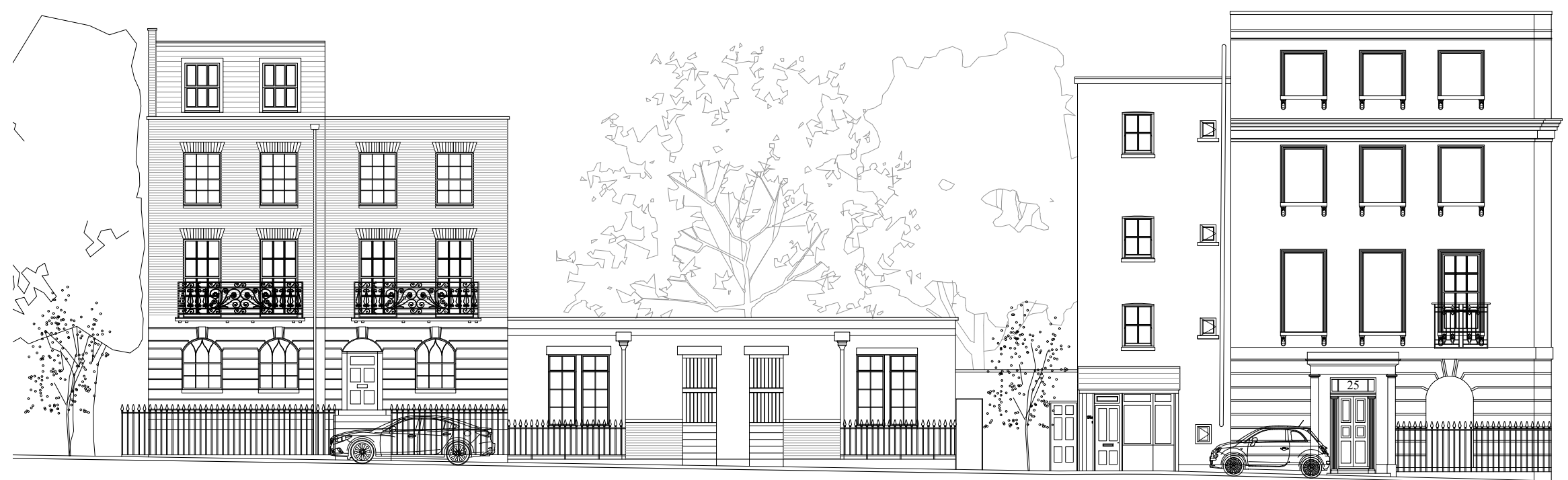
EXISTING CONTEXT FRONT ELEVATION SCALE 1:50