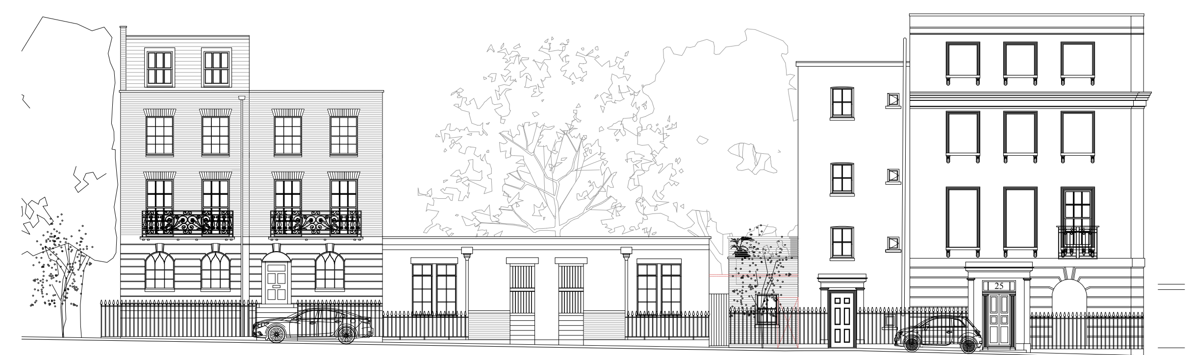
PROPOSED CONTEXT FRONT ELEVATION SCALE 1:50

THIS DRAWING IS COPYRIGHT and must not be traced or copied in any way, in part or whole by any means whatsoever without prior written consent and may only be used by the present owner, being our current client in relation to the property as referred to on the drawing. This drawing may be copied by an authorised officer of the Local Authority with the sole purpose to assist in the determination of Planning or Building Regulations application and may not be used for any other purpose unless otherwise agreed in writing.