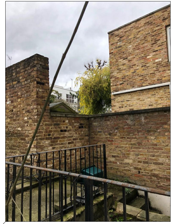
FACING BRICK REAR GARDEN WALLS USED AS PRECEDENT FOR TERRACE LEVEL WALLS INCLUDING SPINE WALL

THIS DRAWING IS COPYRIGHT and must not be traced or copied in any way, in part or whole by any means whatsoever without prior written consent and may only be used by the present owner, being our current client in relation to the property as referred to on the drawing. This drawing may be copied by an authorised officer of the Local Authority with the sole purpose to assist in the determination of Planning or Building Regulations application and may not be used for any other purpose unless otherwise agreed in writing.