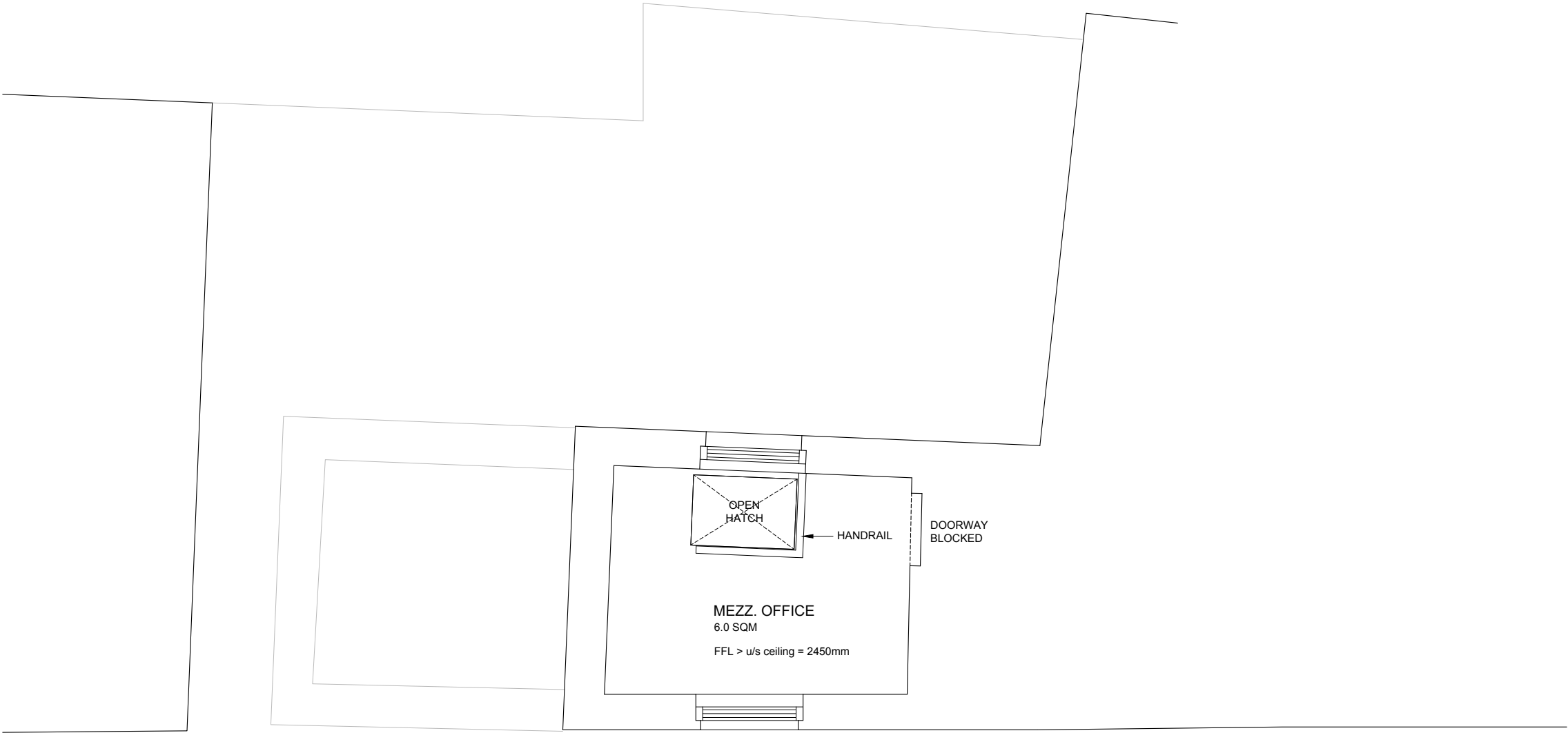
EXISTING FIRST FLOOR / MEZZANINE PLAN SCALE 1:50

THIS DRAWING IS COPYRIGHT and must not be traced or copied in any way, in part or whole by any means whatsoever without prior written consent and may only be used by the present owner, being our current client in relation to the property as referred to on the drawing. This drawing may be copied by an authorised officer of the Local Authority with the sole purpose to assist in the determination of Planning or Building Regulations application and may not be used for any other purpose unless otherwise agreed in writing.