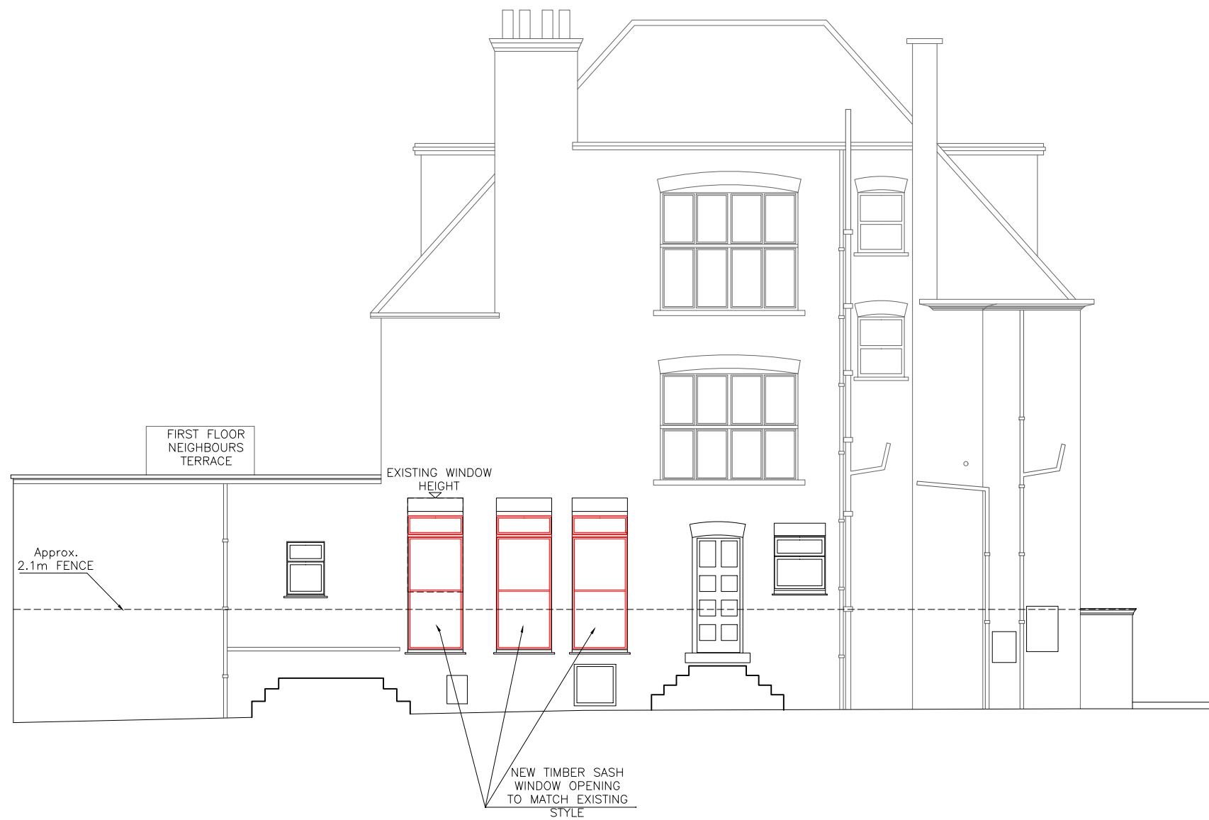
PROPOSED SIDE (WEST) ELEVATION

THIS DRAWING AND DESIGN IS THE PROPERTY OF AS-STUDIO LTD AND MUST NOT BE ISSUED, LOANED OR COPIED WITHOUT WRITTEN CONSENT