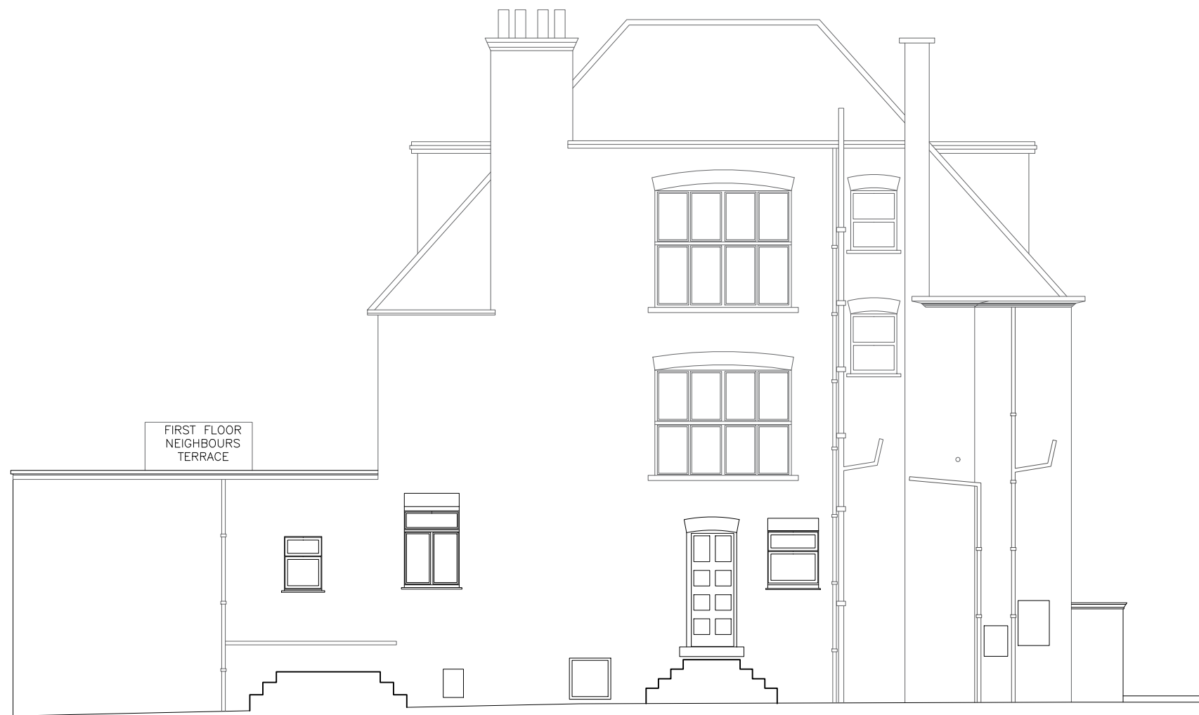
EXISTING SIDE (WEST) ELEVATION