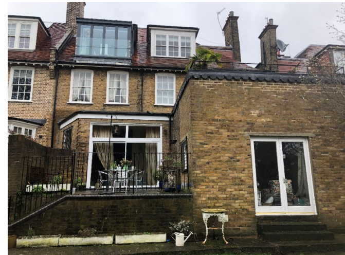
Rear elevation view