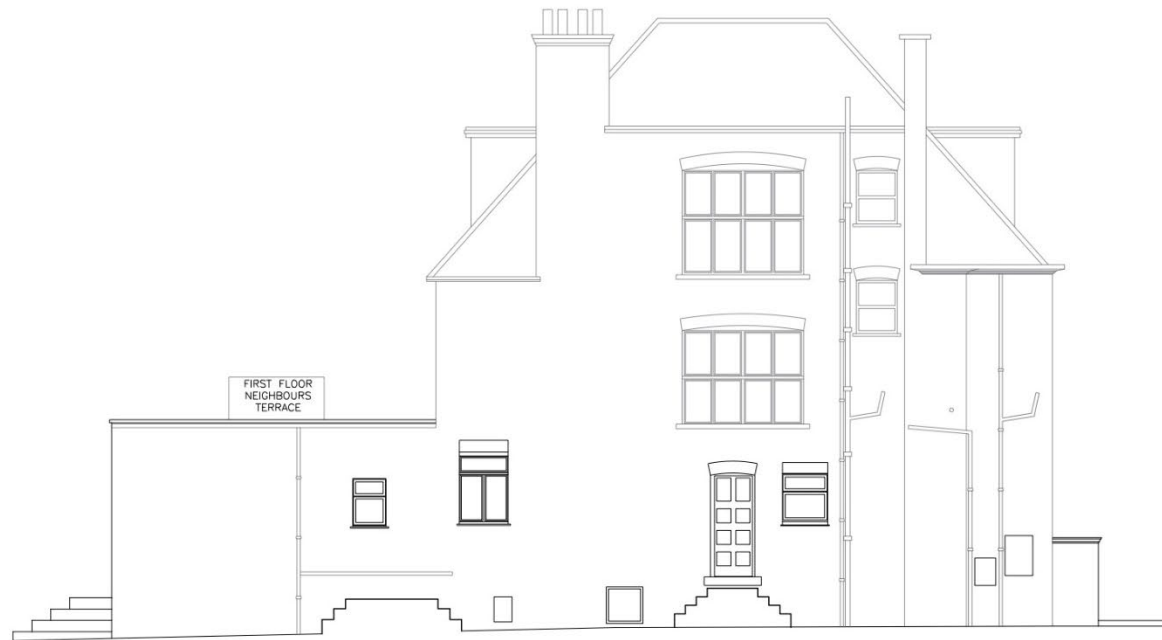
Proposed Side (West) Elevation