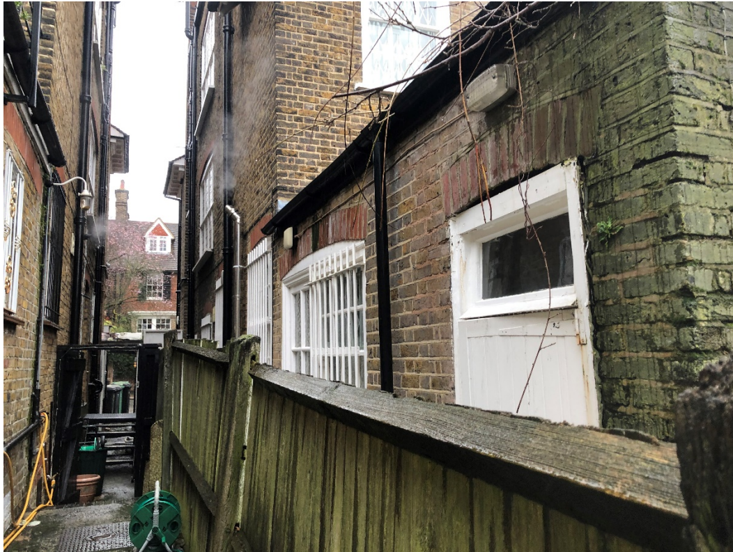
Side elevation view