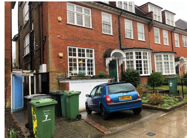
Front street elevation view