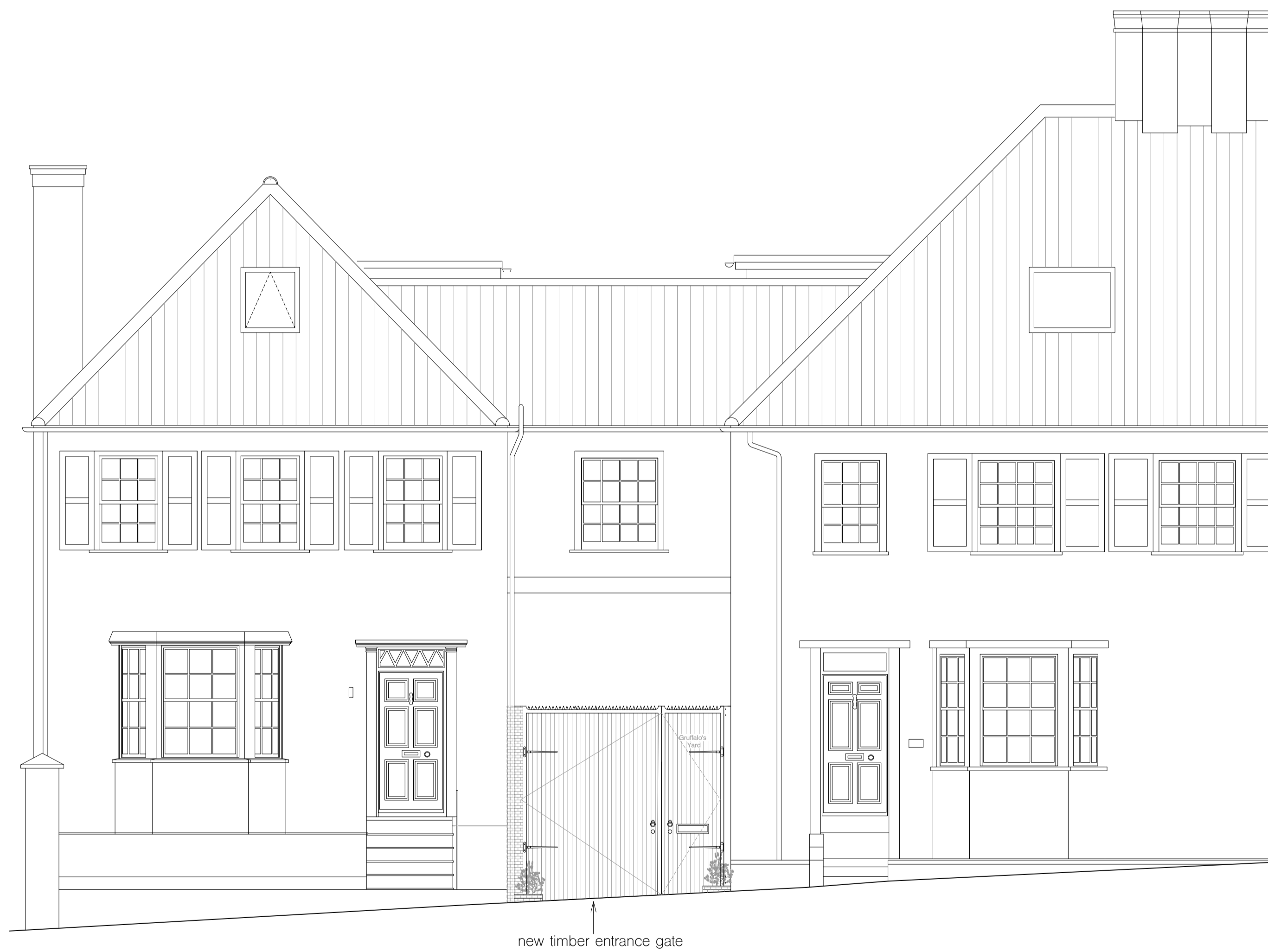
1 proposed elevation 1:50@A1