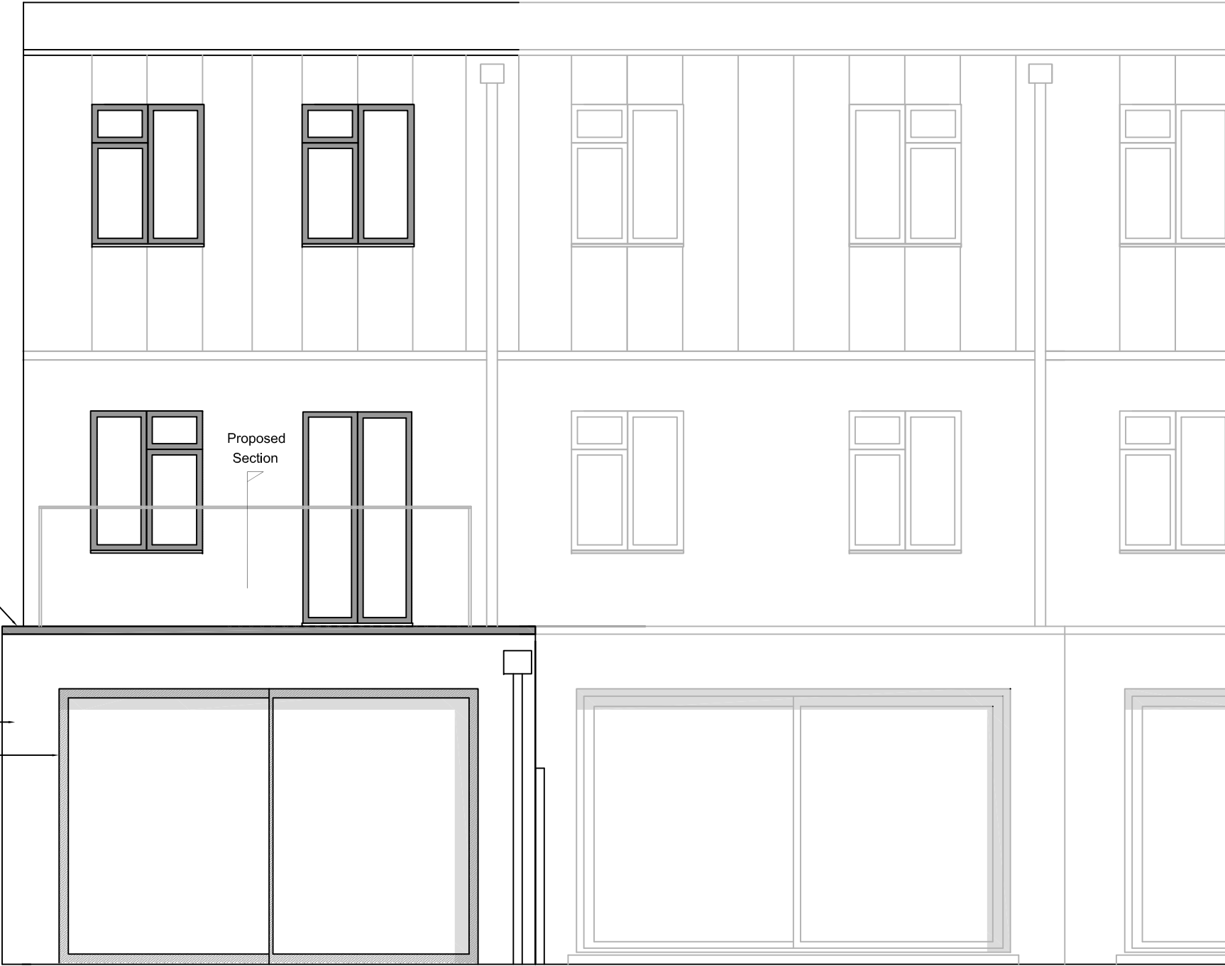
Proposed rear elevation - Scale 1:50 A3