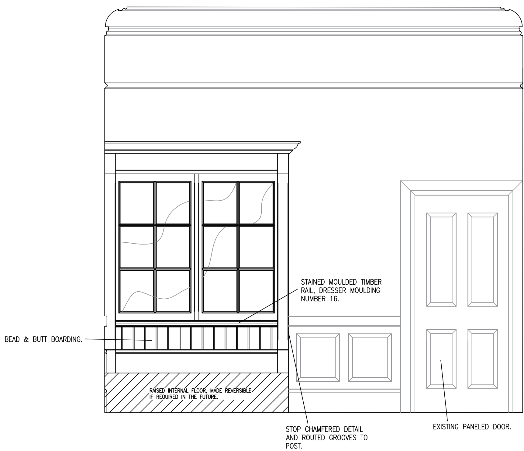
INTERNAL LOBBY ELEVATION A

A 12.6.19 BALUSTRADE AND RAISED FLOOR DETAIL ADDED. JMD