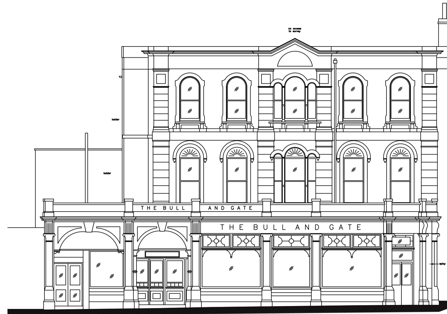
FRONT ELEVATION A - A