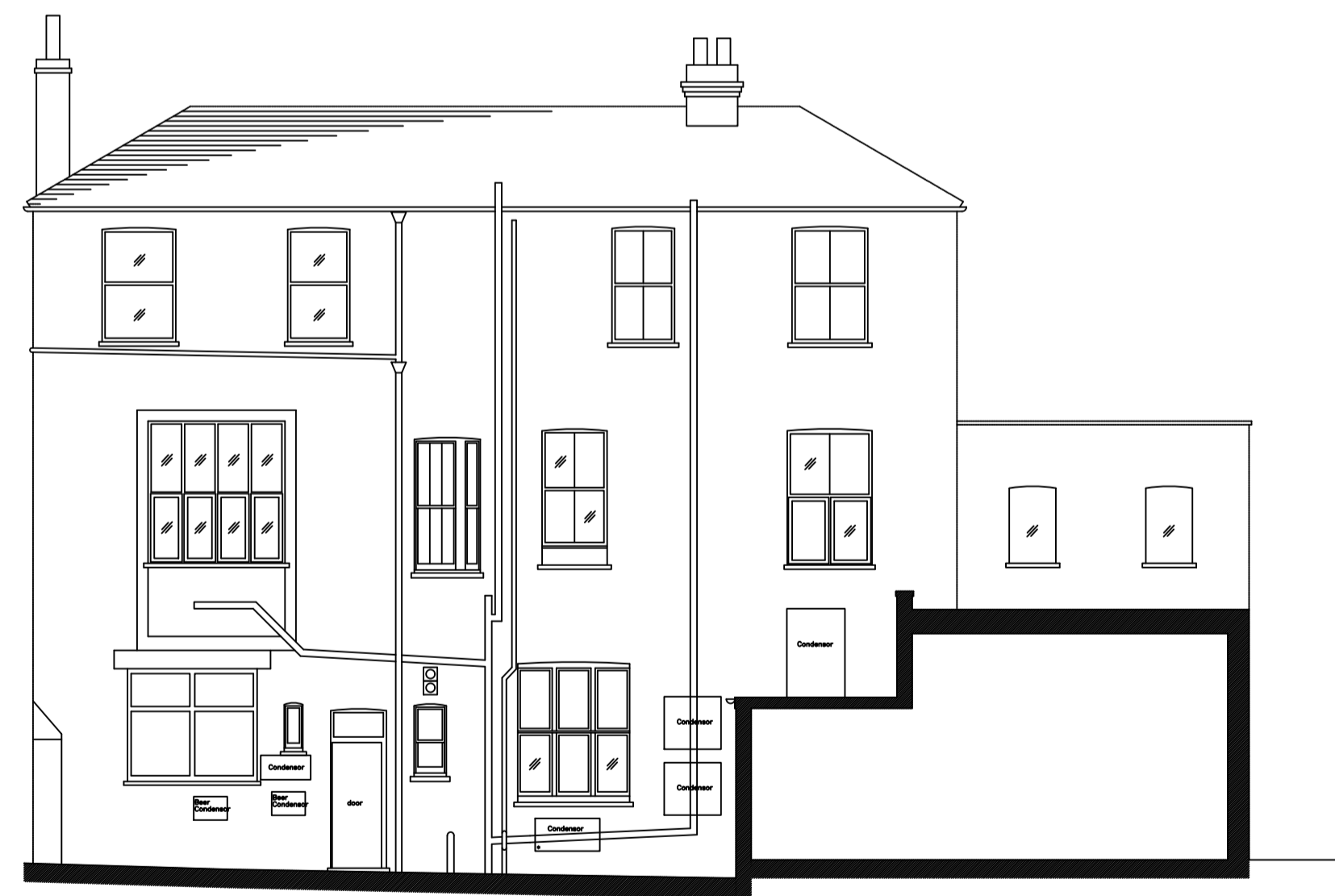
REAR ELEVATION C - C