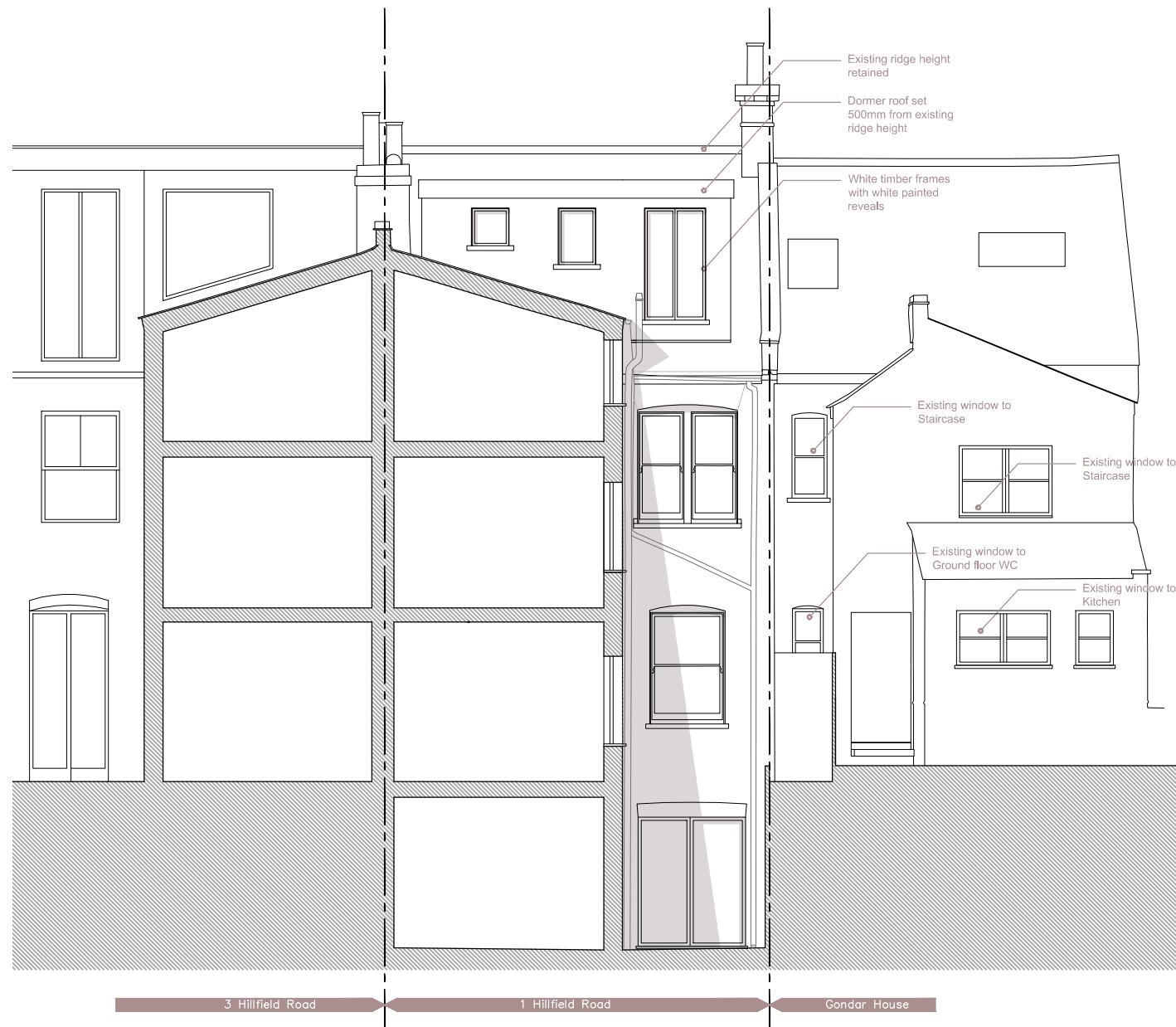
Proposed Section CC - 1:100@A3

All plans, sections & elevations are based on measured readings and any scaled dimension should not be relied upon to give an accurate measurement.