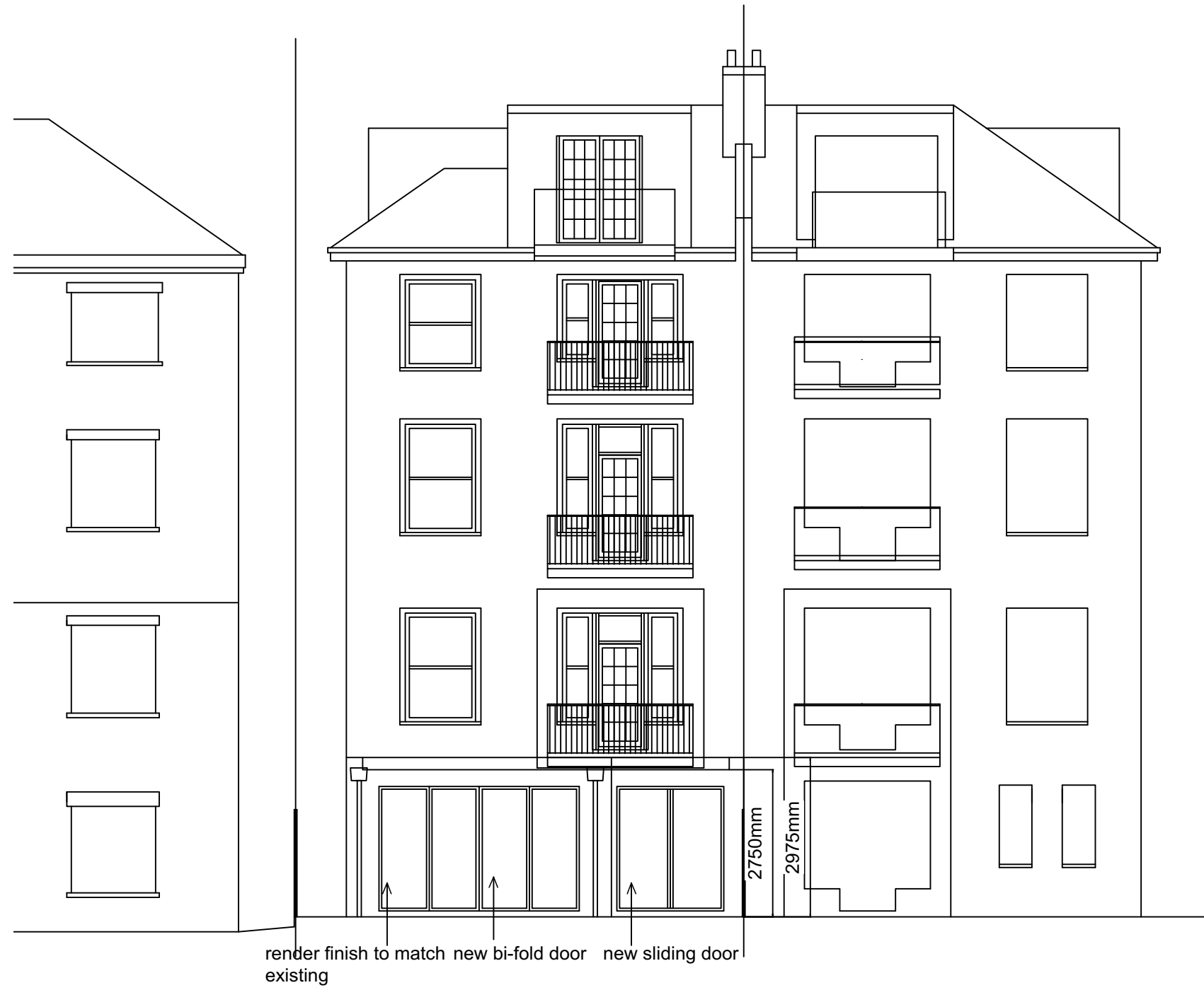
PROPOSED REAR ELEVATION (SOUTH EAST)