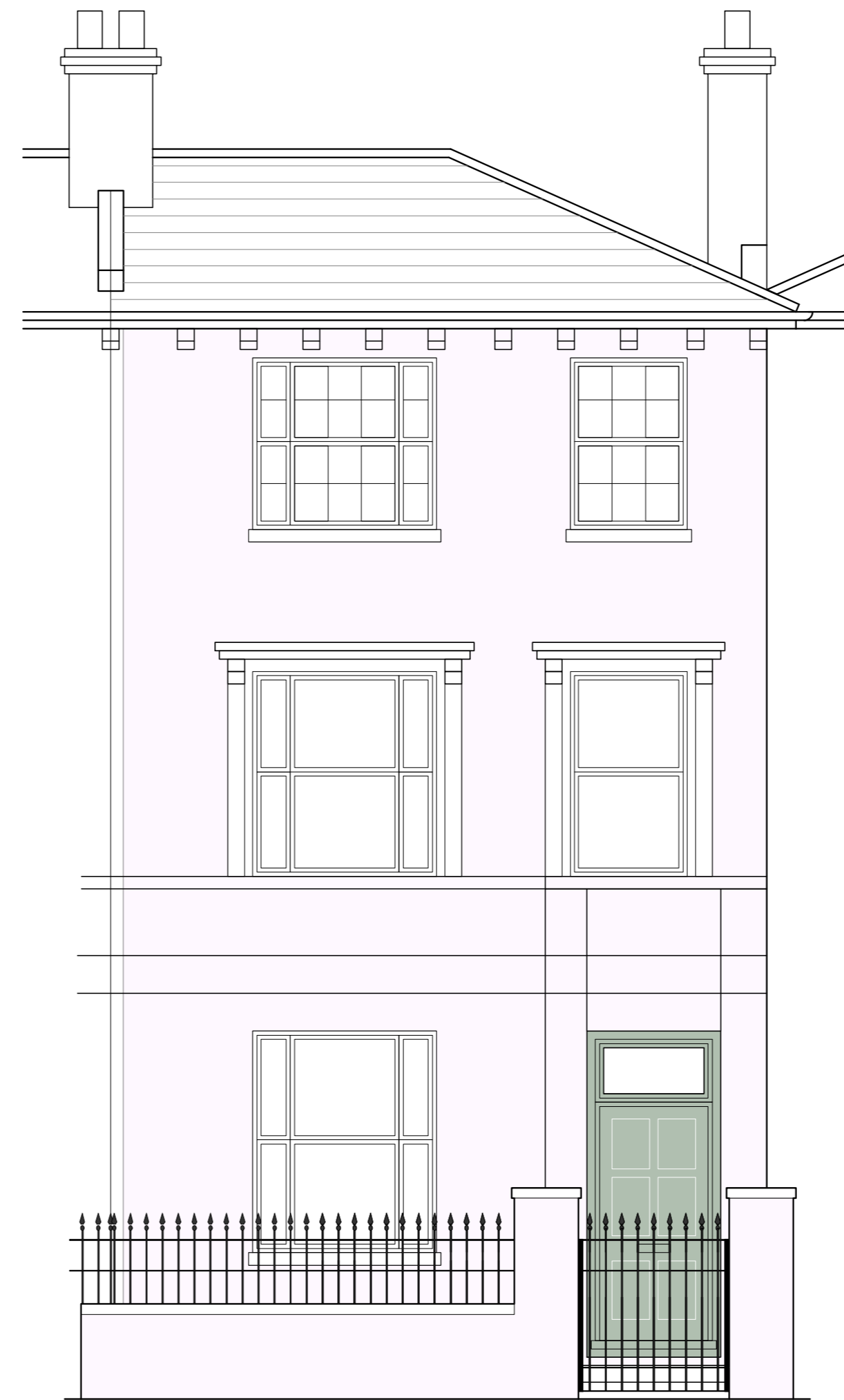
Proposed Front Street Level Elevation Scale: 1:50