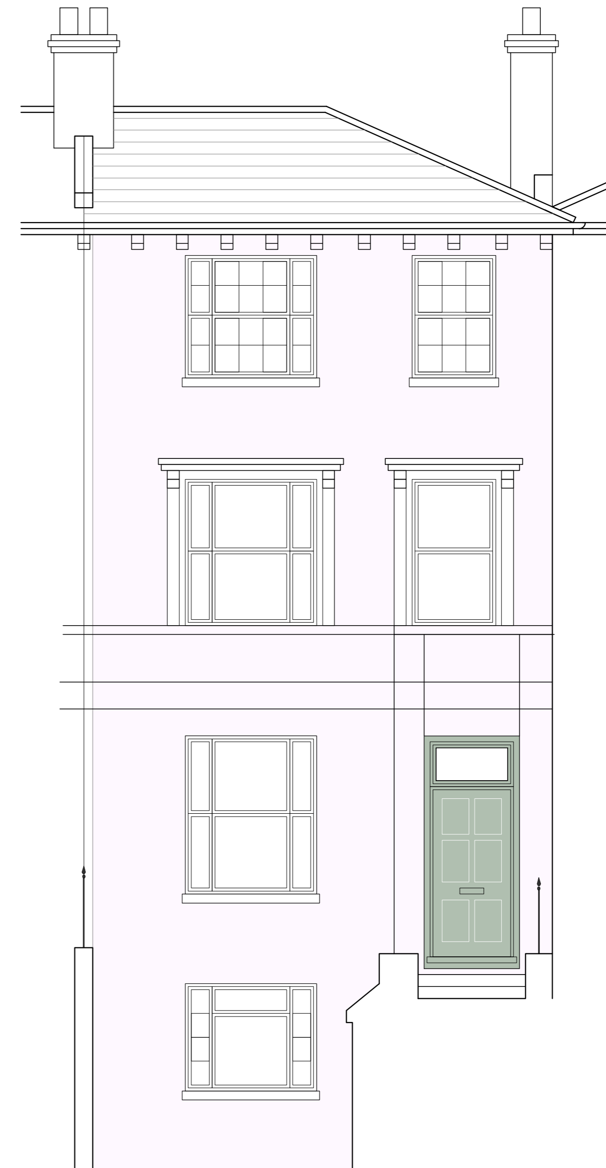
Proposed Front Lightwell Elevation Scale: 1:50