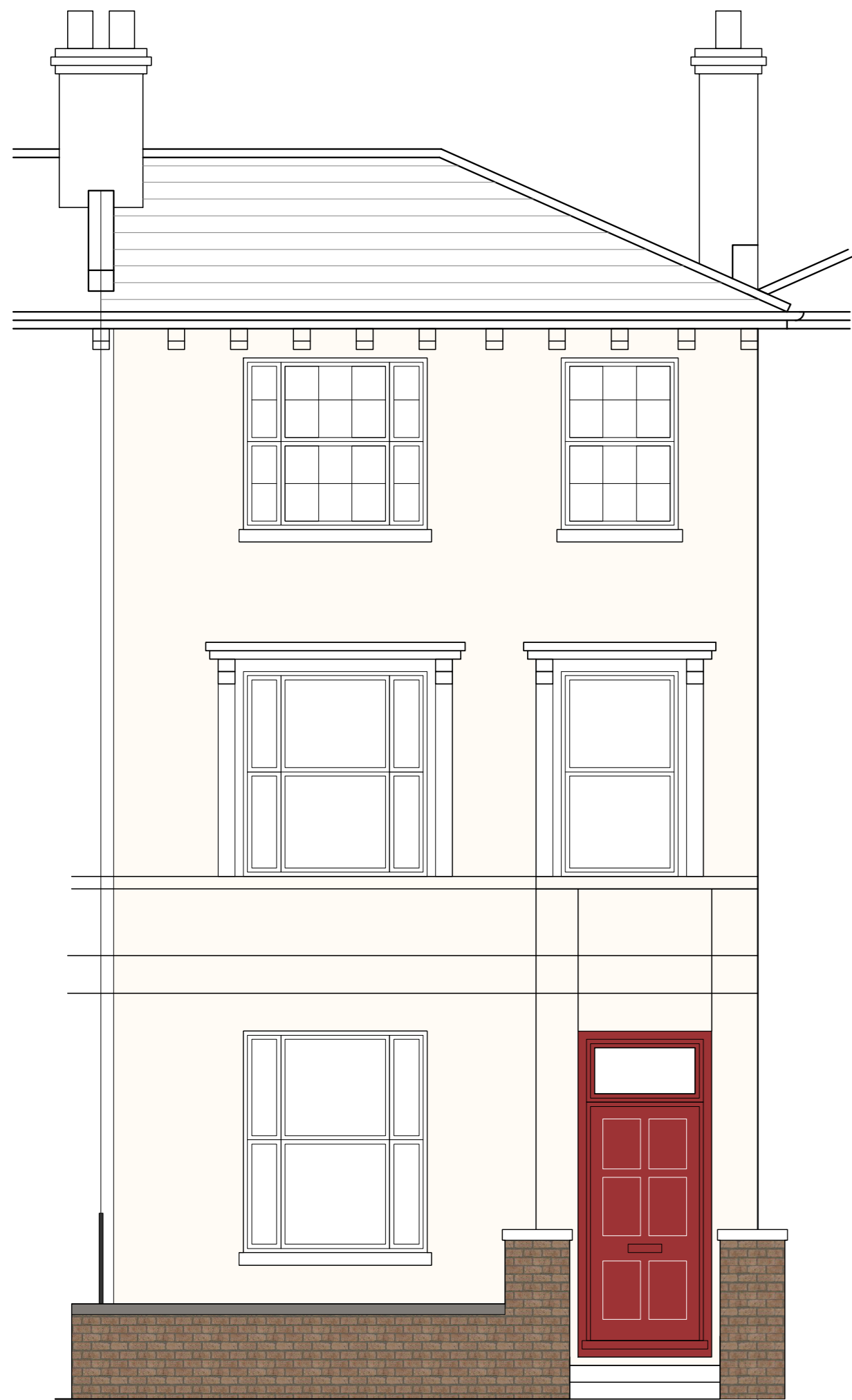
Existing Front Street Level Elevation Scale: 1:50