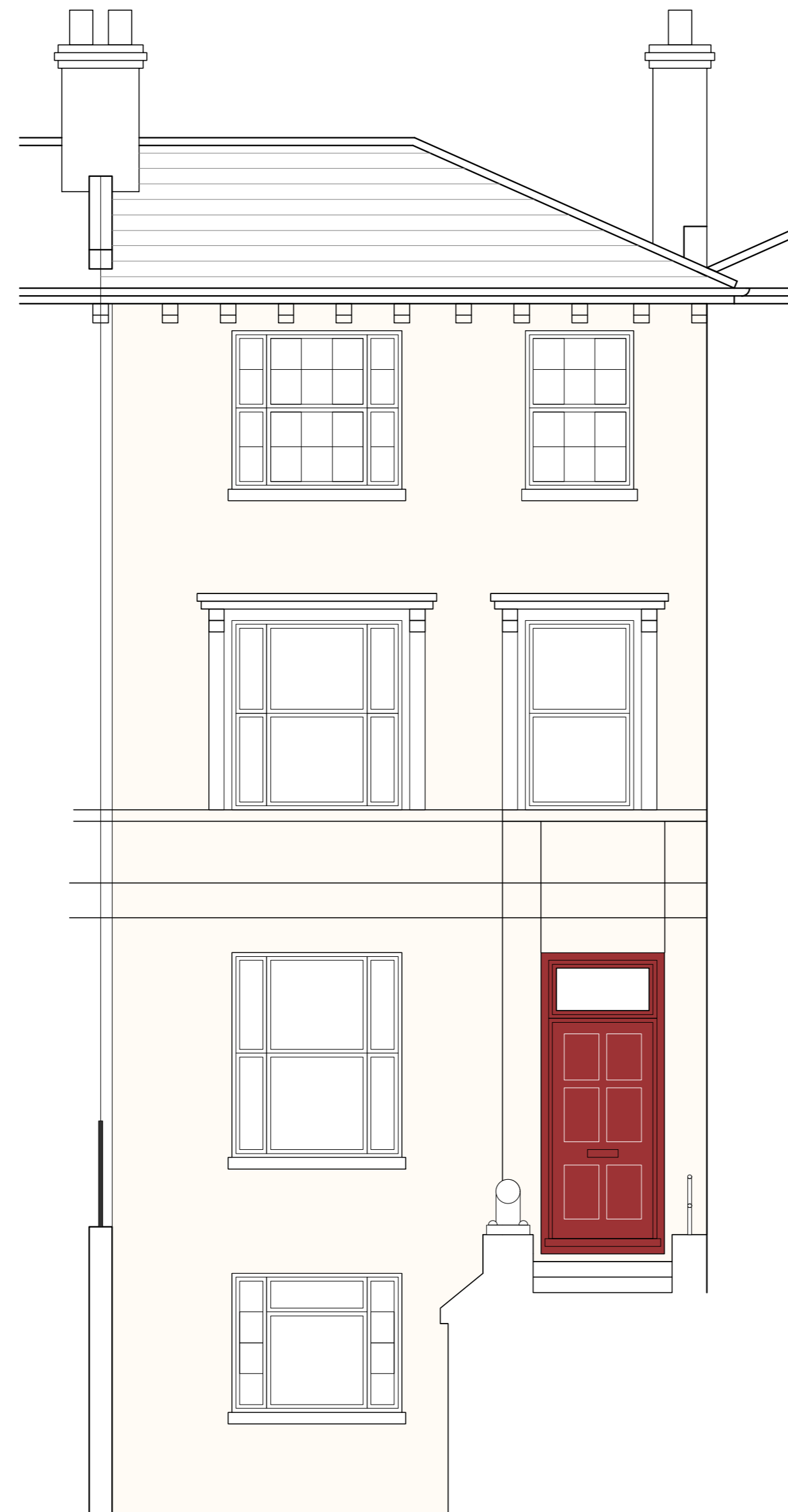
Existing Front Lightwell Elevation Scale: 1:50