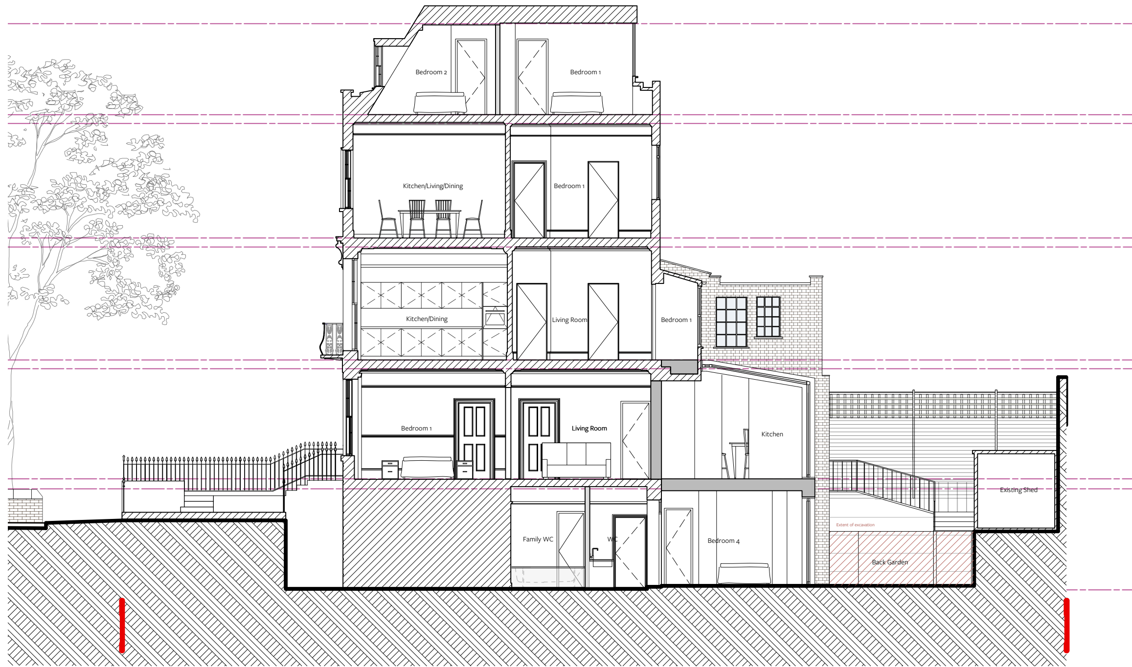
Proposed Section 01 scale 1:100 @A3