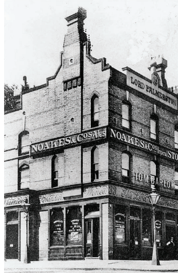
Historical ref. showing the lamppost that was retained & converted into the current post sign pictorial.