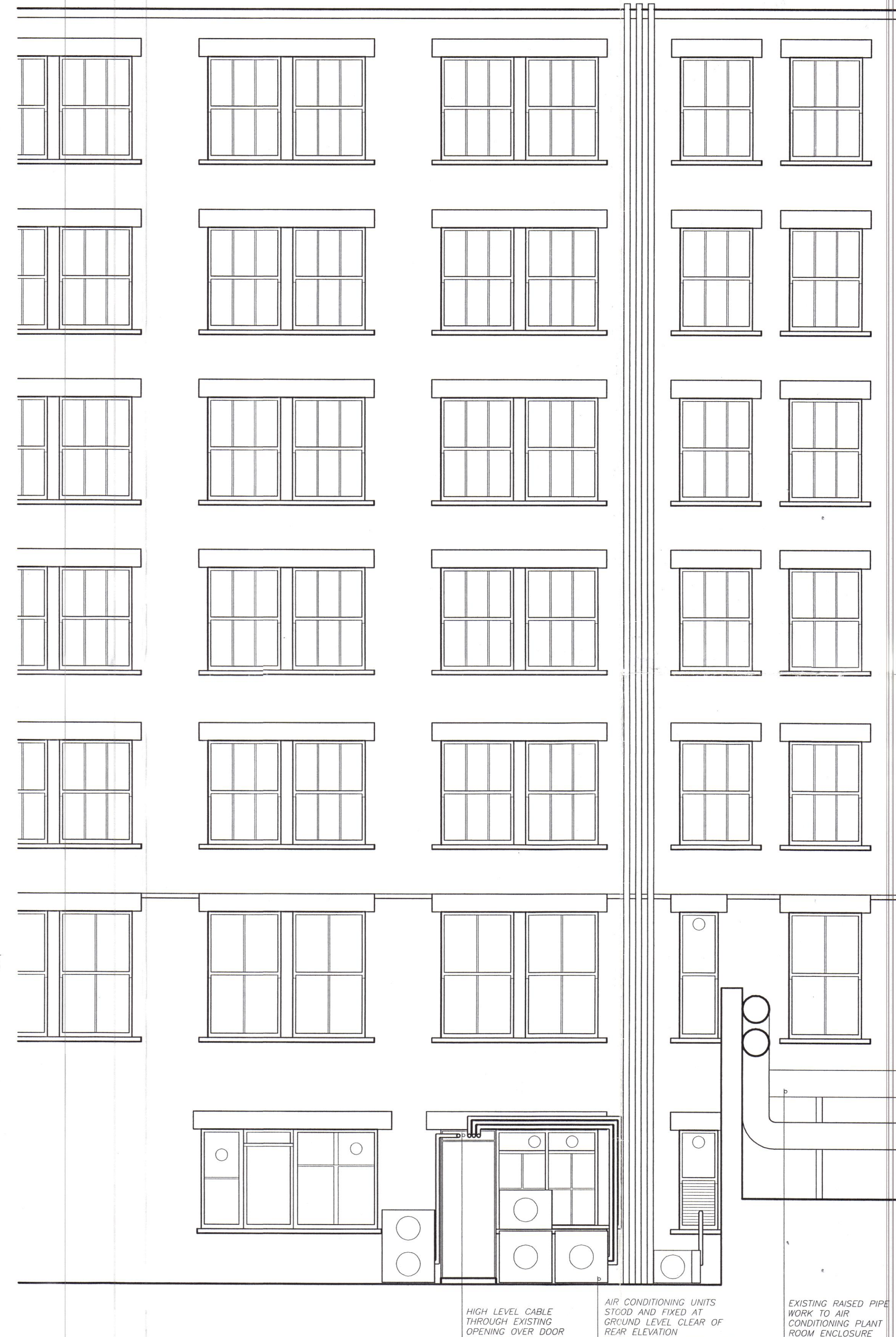
ELEVATION LAYOUT FOR REAR YARD

LONDON BOROUGH OF CAMDEN TOWN AND COUNTRY PLANNING ACTS 10 SEP 2005 RECOMMENDATION AGREED ON BEHALF OF THE COUNCIL