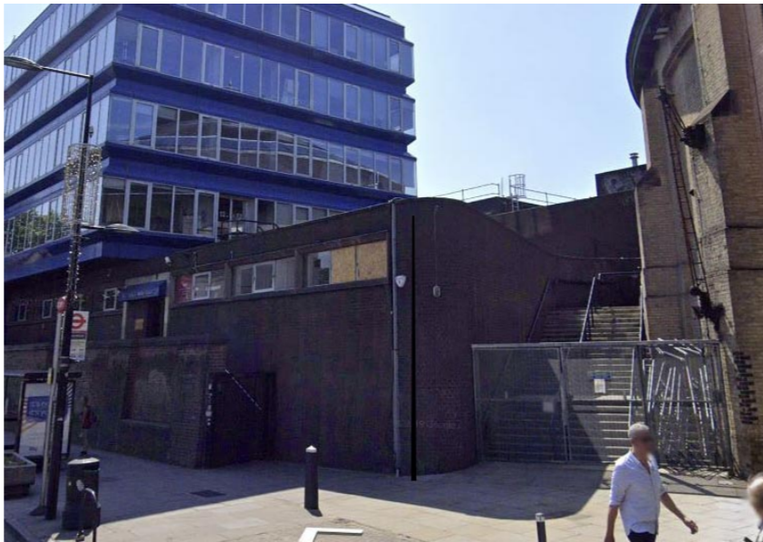
LOCATION B WITH POLE