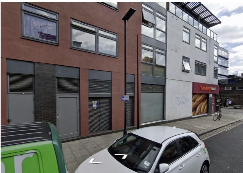
LOCATION A WITH POLE

A 5.5m high, 76dia pole at the rear of the footpath centred on the first red pier beyond the white rendered flank elevation with a filament crossing Chalk Farm Road to a tapered pole adjacent to the curved end of the office block approx 150 to the right of the high level white alarm box.