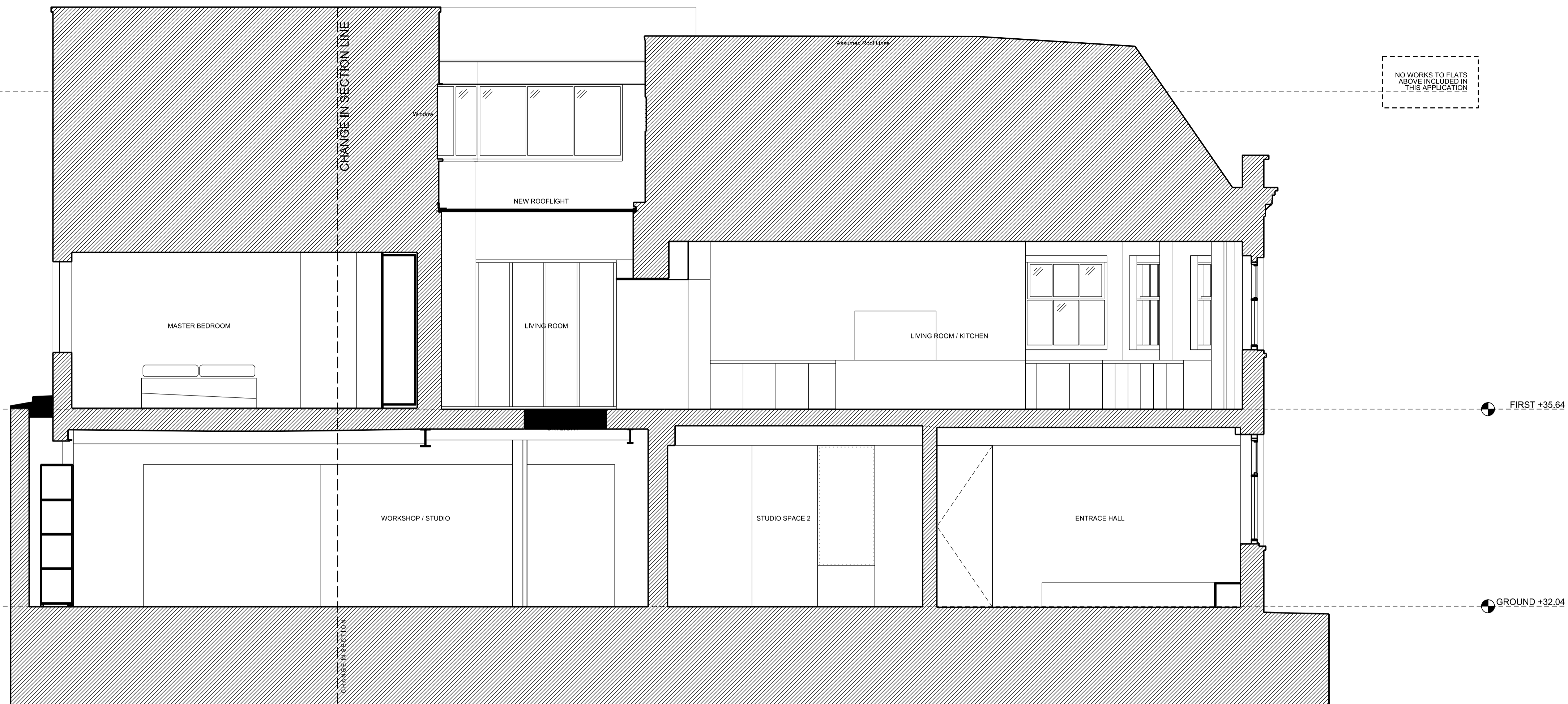
EXISTING SECTION Y2

NO WORKS TO FLATS ABOVE INCLUDED IN THIS APPLICATION