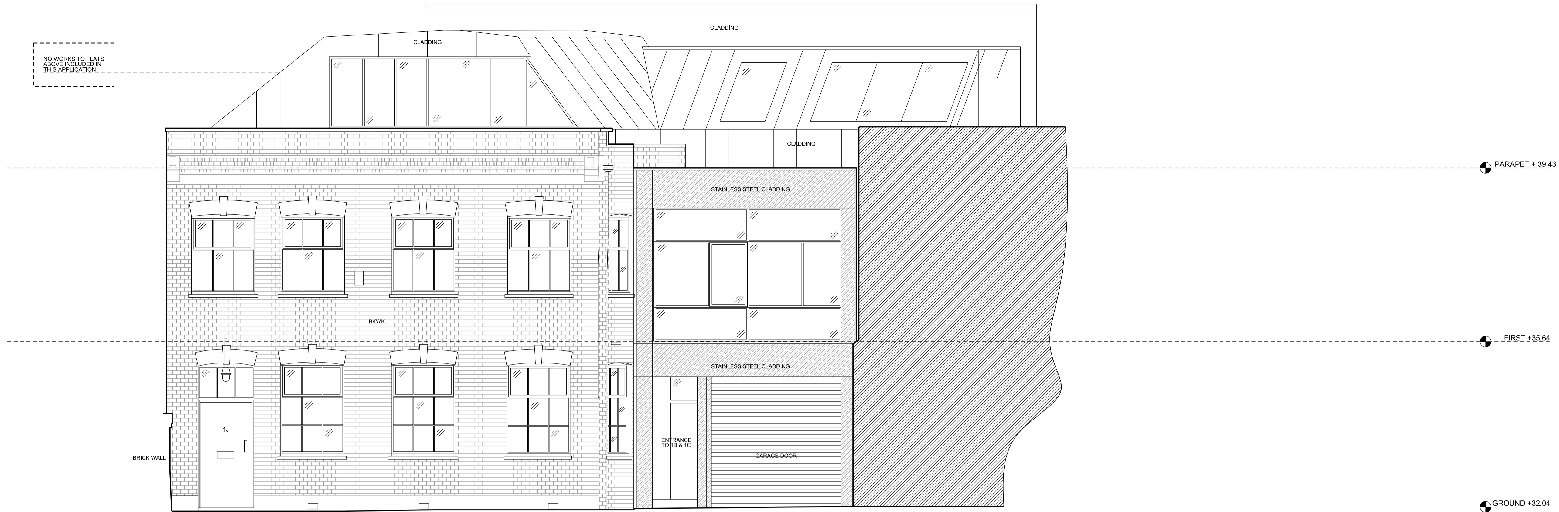
EXISTING SECTION X1

* This drawing is Copyright © McLaren Excell Ltd.