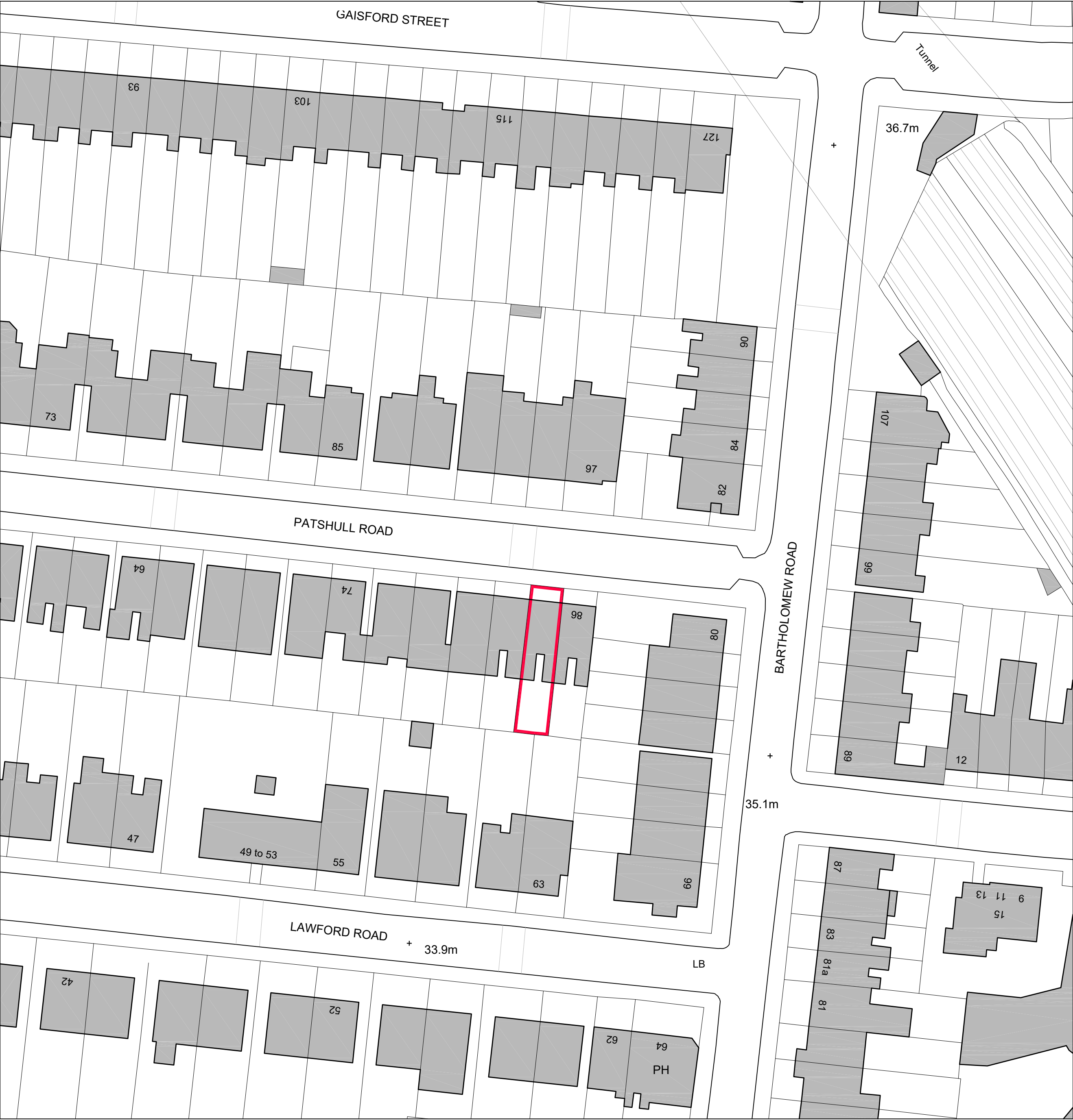
Block Plan 0 5 10 20 30 40 50m SCALE 1:500