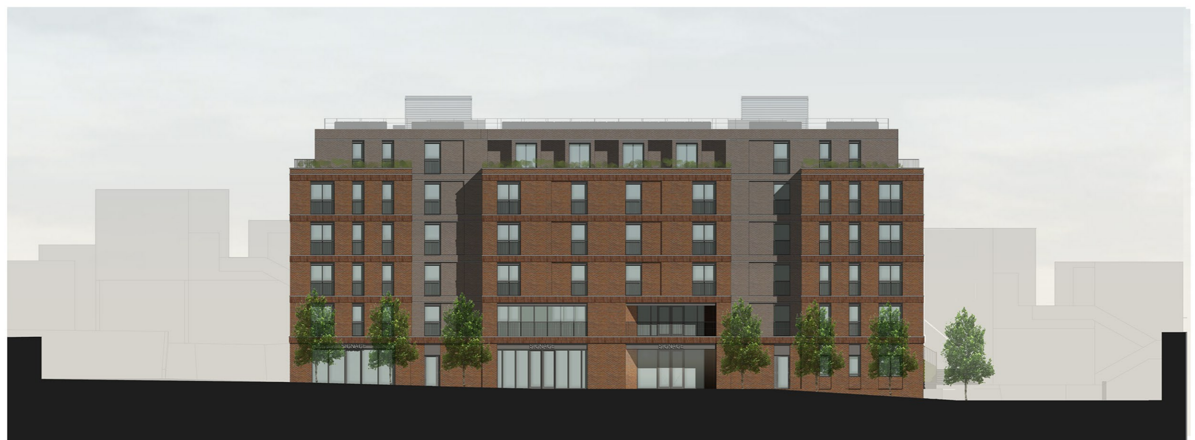
2 North Elevation 1:100