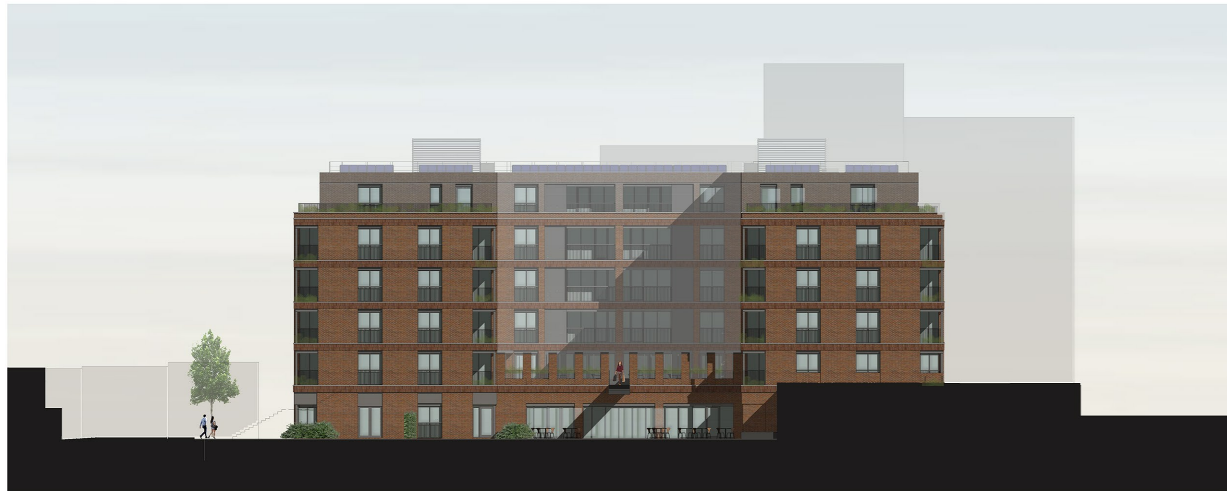
1 South Elevation 1:100