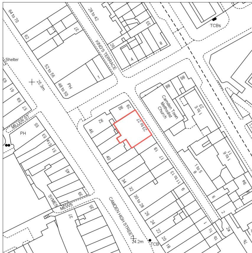
City Images, 23-27, Kings Terrace, London