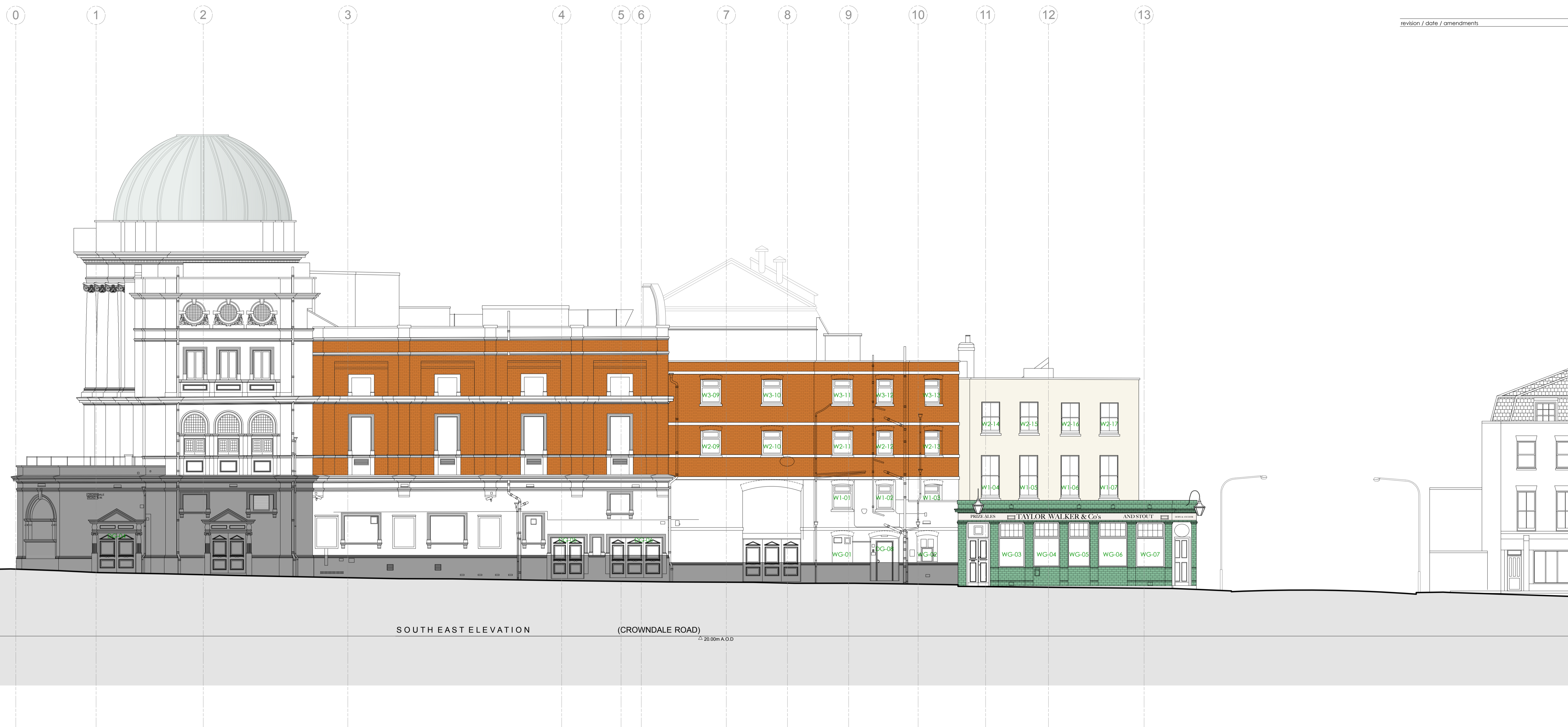
SOUTH EAST ELEVATION (CROWNDALE ROAD) \Delta 20.00m A.O.D.