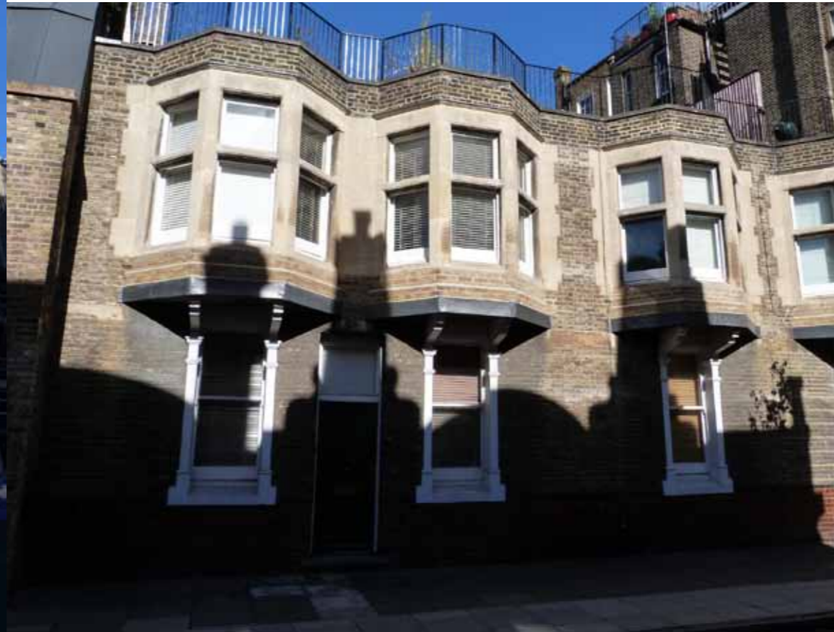
Front elevation 14,12 Northington Street and 28 John Street