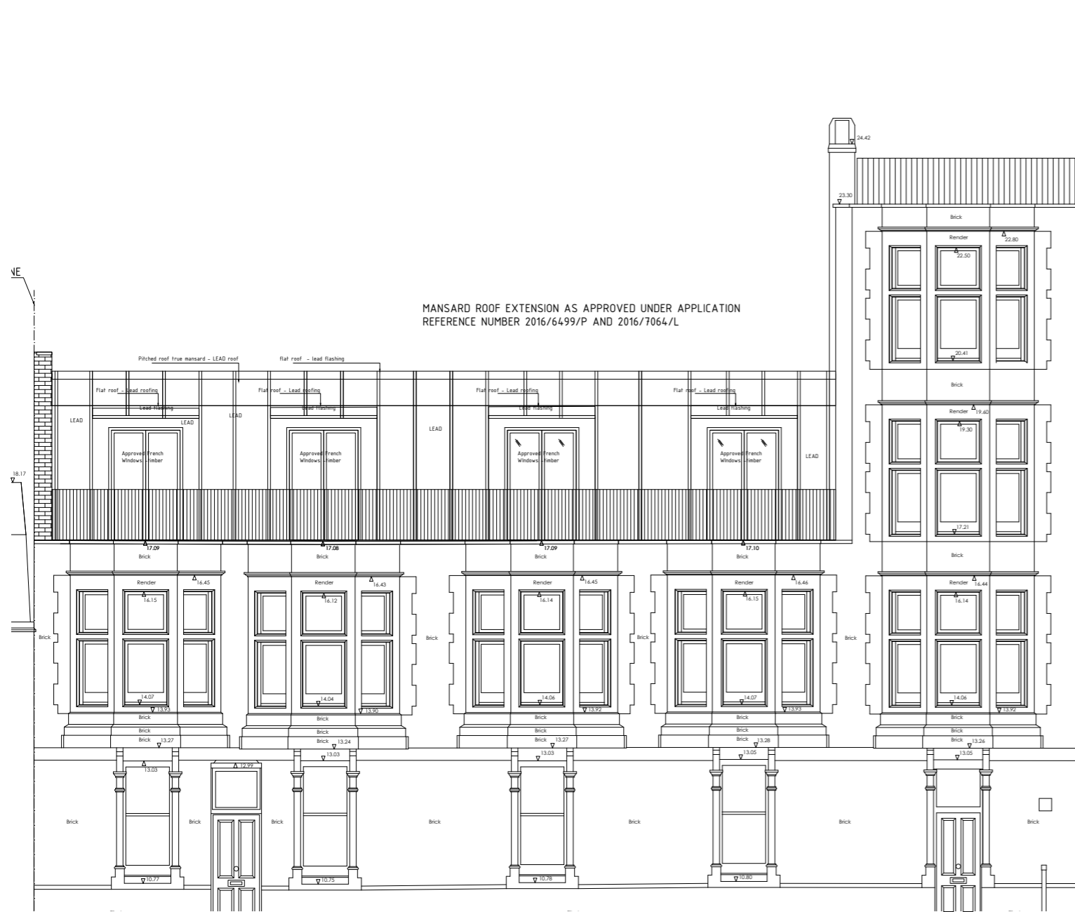
FRONT ELEVATION AS EXISTING ( & APPROVED PREVIOUSLY)