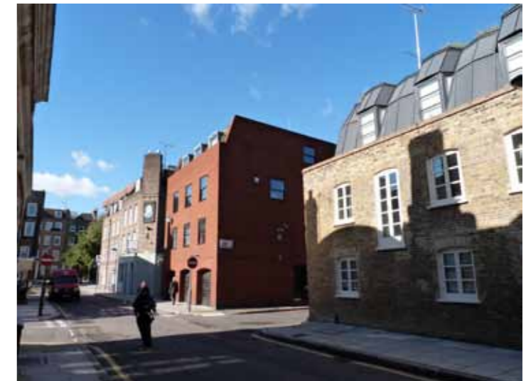
NORTH elevation Northington Street towards house numbers 16 etc.

The site is located in Northington Street which belongs to Bloomsbury Conservation Area.