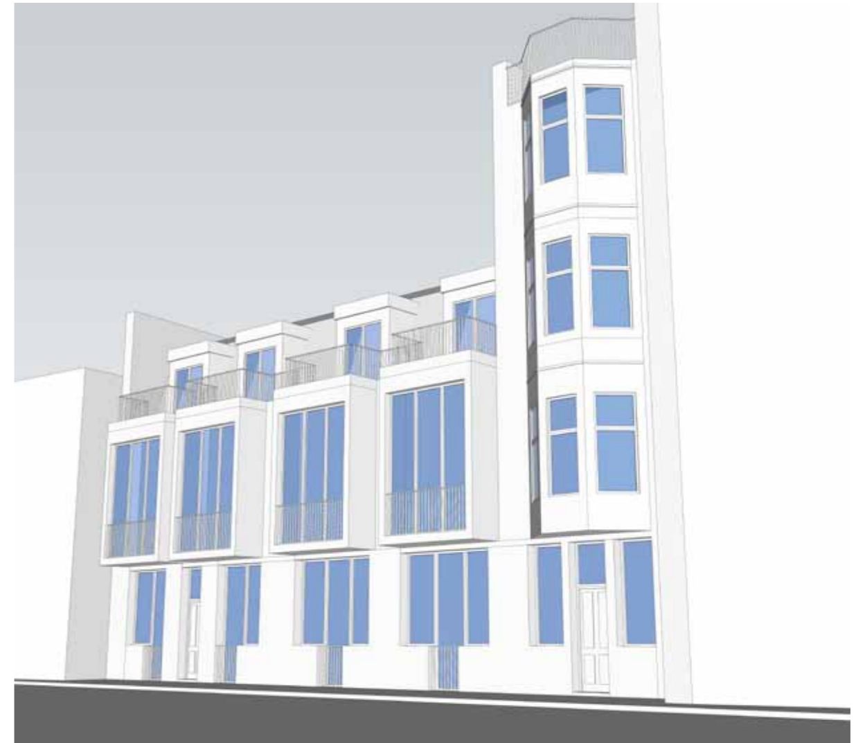
ARTIST IMPRESSIONS FRONT ELEVATIONS