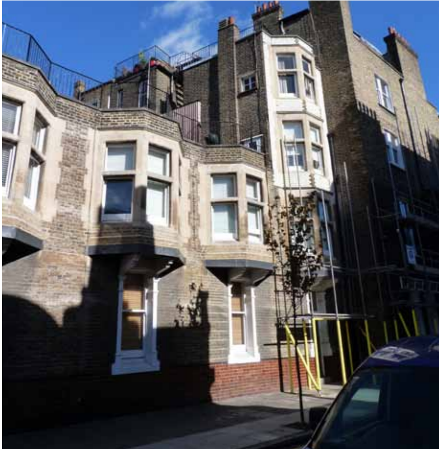
Front elevation 12 Northington Street