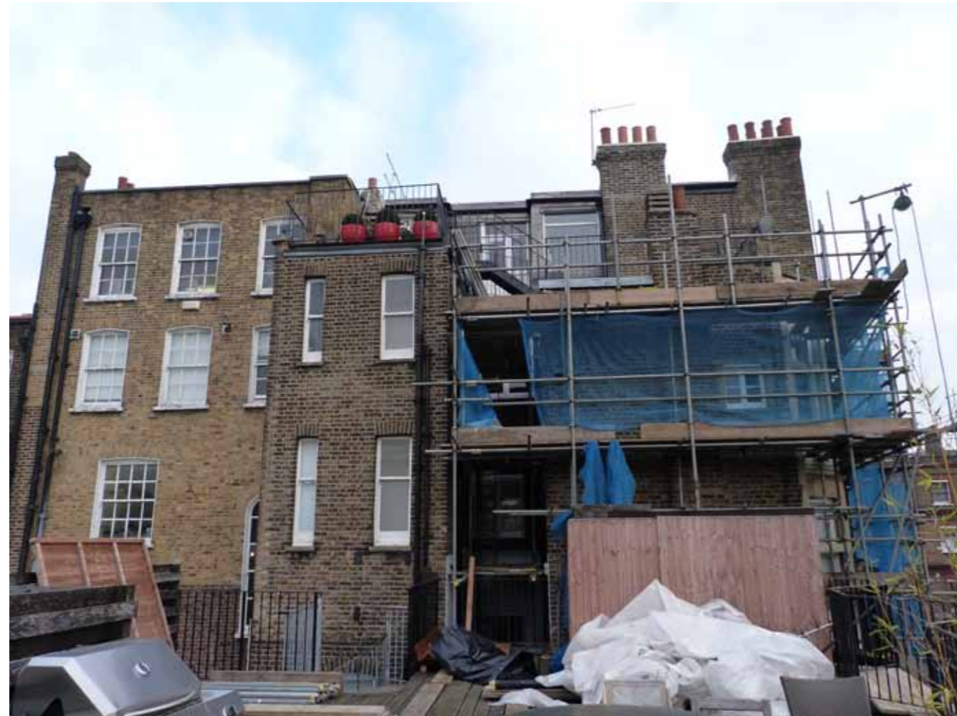
View from Roof Terrace onto 28 John Street