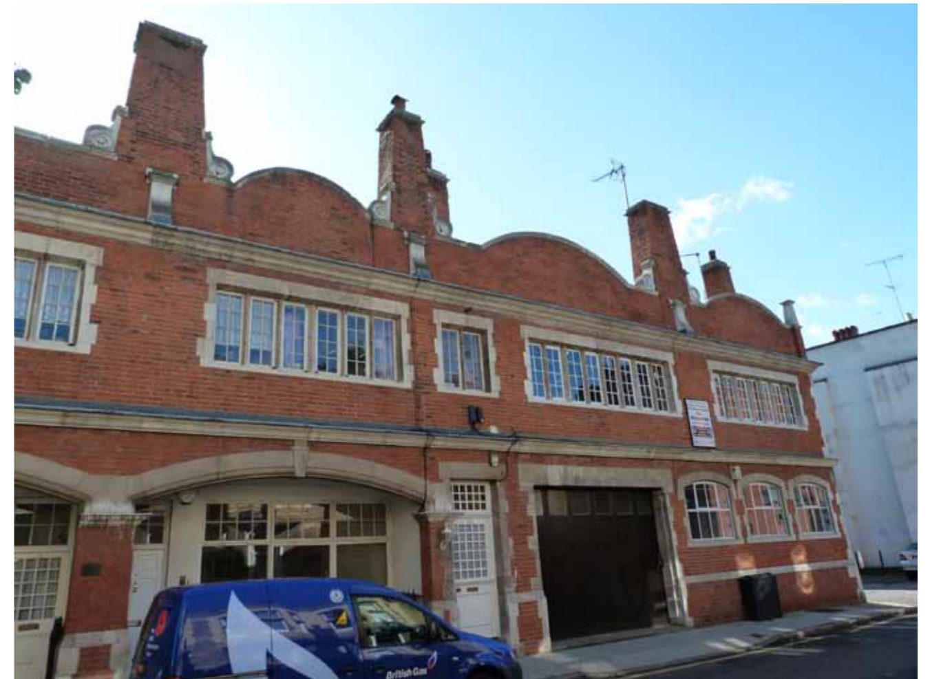
House Opposite 12 Northington Street