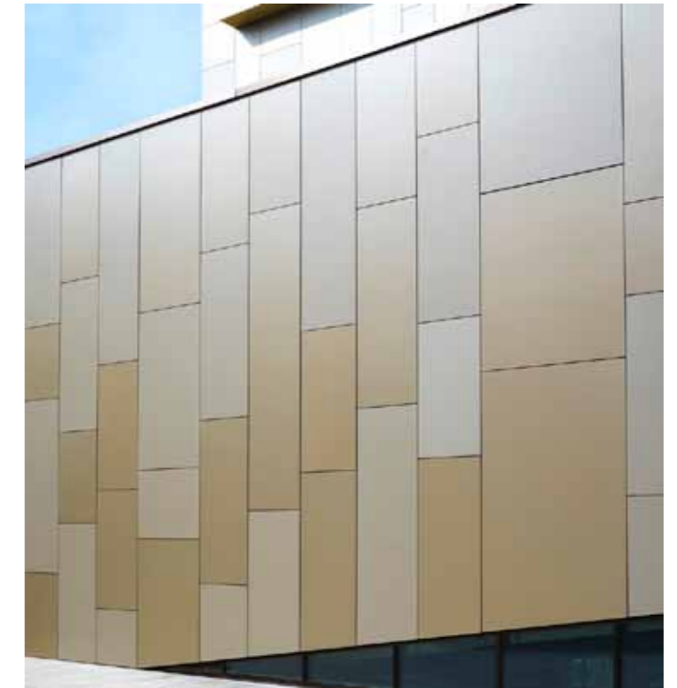
NEW CLADDING TO FRONT FACADE Metallic Cladding by Trespa Medeon or similar approved mechanically fixed to new wall construction