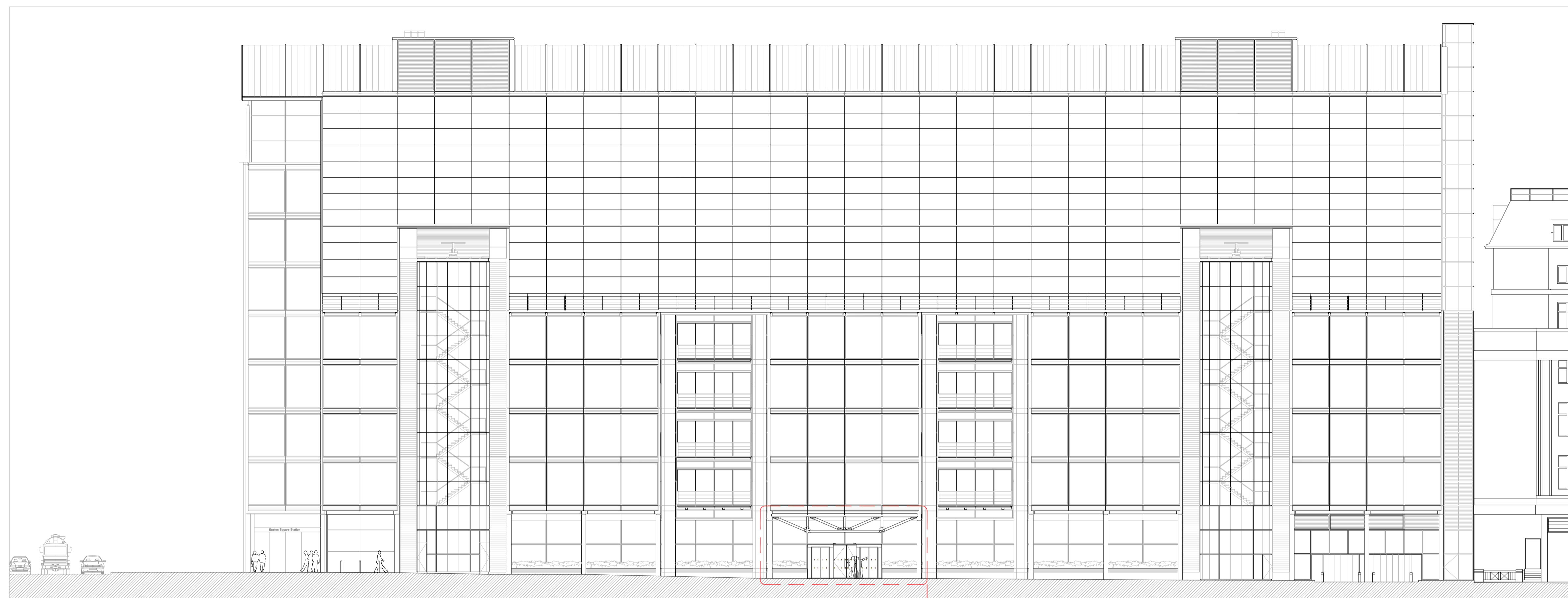
01 General Arrangement - Proposed Elevation 1:200 @ A1

DISCLAIMER: This drawings is based on CAD drawings from a third party, as such 3|10 Studio cannot guarantee its accuracy. Do not scale dimensions off drawings. Use written or calculated dimensions. The contractor is responsible for checking dimensions before ordering or starting work. This document contains confidential and proprietary information that cannot be reproduced or divulged, in whole or in part, without written authorisation from 3|10 studio ltd. DRAWINGS NOT FOR CONSTRUCTION PURPOSES