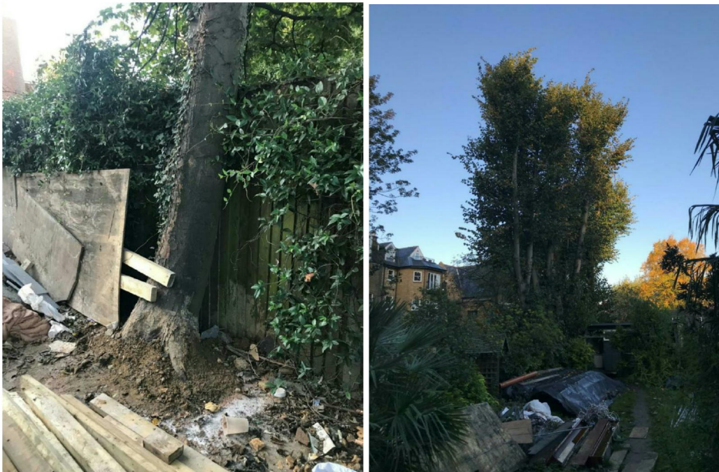
Lack of RPA and trunk protection for sycamore and three limes; builders showing contempt for RPAs.

This entire development has taken place without any protection for the trees noted in the Arboricultural Impact Assessment Method Statement & Tree Protection Plan. This is demonstrated in the following pictures, and others are available. The builders have shown complete contempt for the RPAs, piling up materials on the trees' roots including RSJs, and leaning materials and tools up against the tree trunks.