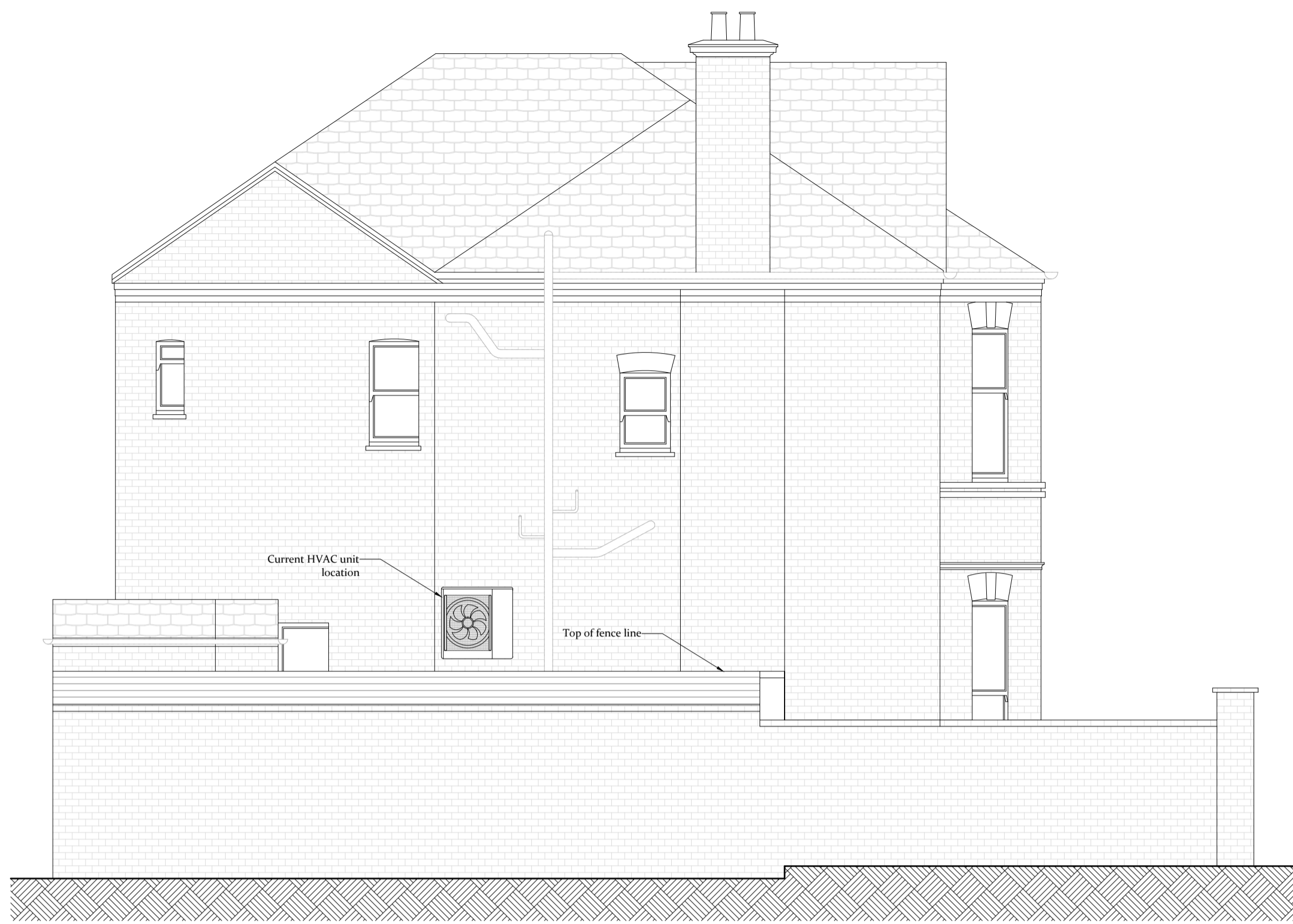
ST 01 EXISTING SIDE ELEVATION 01 SCALE 1:50 @ A1