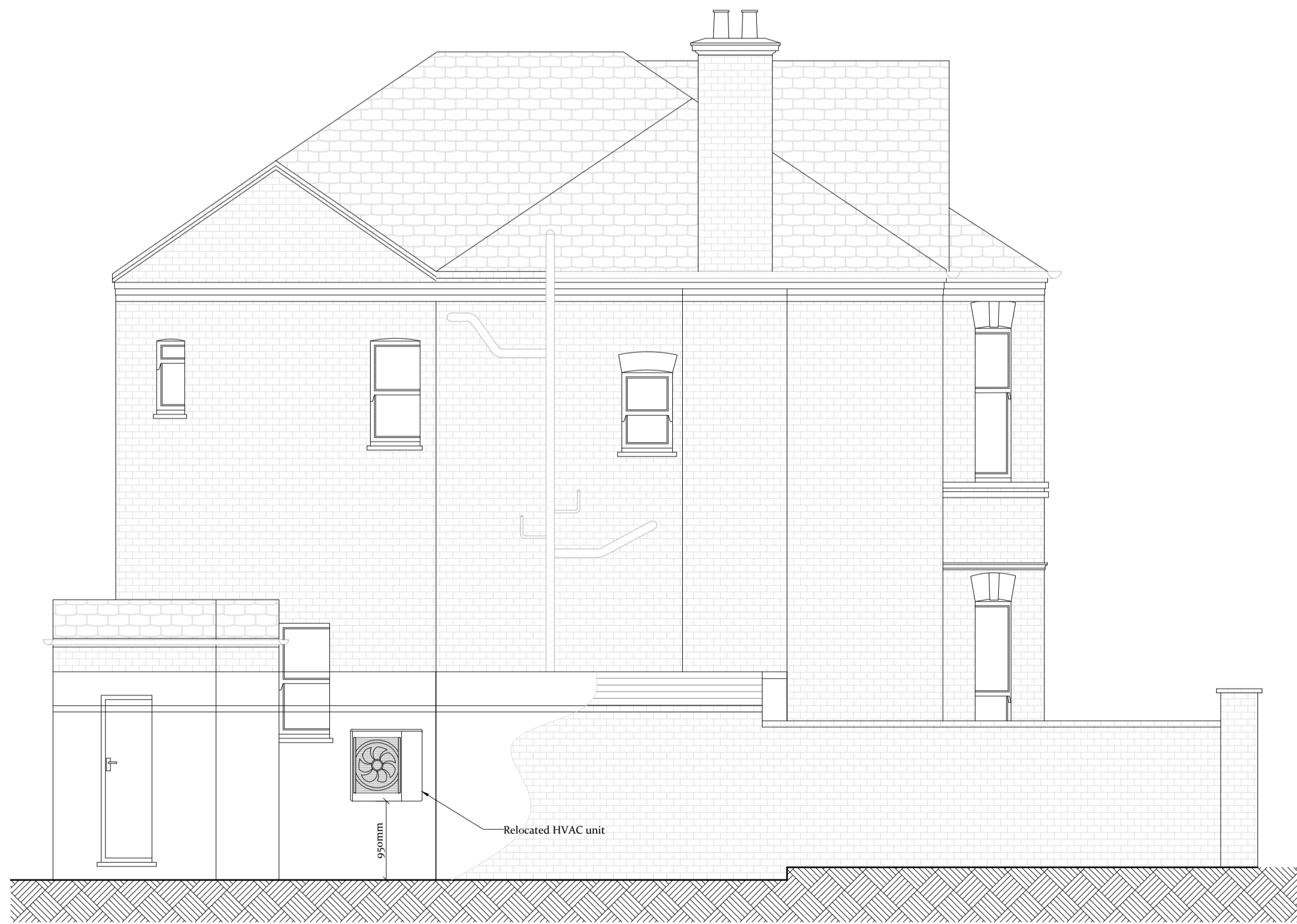
ST 01 PROPOSED SIDE ELEVATION 02 SCALE 1:50 @ A1