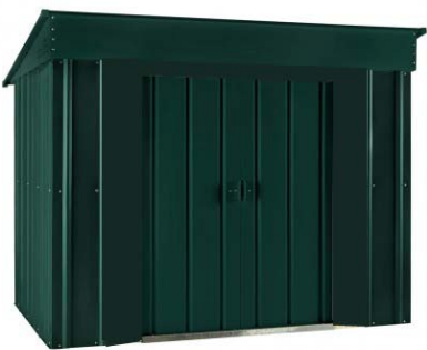
Lotus 6ft x 4ft Low Pent Solid Metal Shed in Heritage Green