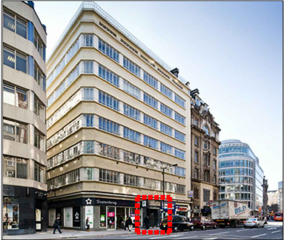
2 EXISTING ENTRANCE – VIEW FROM HIGH HOLBORN scale: