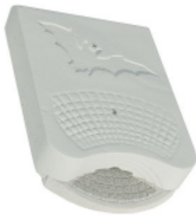
Bat Winter Roost 1WQ

in All-season, Bat Conservation on buildings