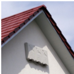
3x 1WQ roosts installed in a group