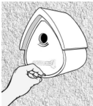
unlicking the front panel