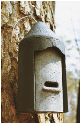
Bat Box 2F