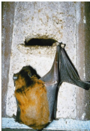
Common Noctule Bat at the entrance hole of a 2F Bat Box

Species such as the Lesser Noctule and the Common Noctule, as well as Daubenton's, Nathusius's Pipistrelle and Bechstein's Bat, are typical representatives of Bats that live in woods and forests. They prefer Bat Boxes as closed systems, as in nature they prefer, for example, woodpecker cavities and hollow tree branches. However, as old, diseased or dead trees tend not to be available or rather are removed from managed forests, natural roosts for Bats have become scarce. Bat Boxes can provide a remedy and are readily accepted by the animals. So-called "House Bats" are mainly those that like to roost in buildings, for example, in roller shutter boxes, behind window shutters, niches and gaps. These are, above all, Serotine, Mouse-Eared and Pipistrelle Bats. These Bats prefer, for example, flat boxes or round boxes with several hanging panel partitions.