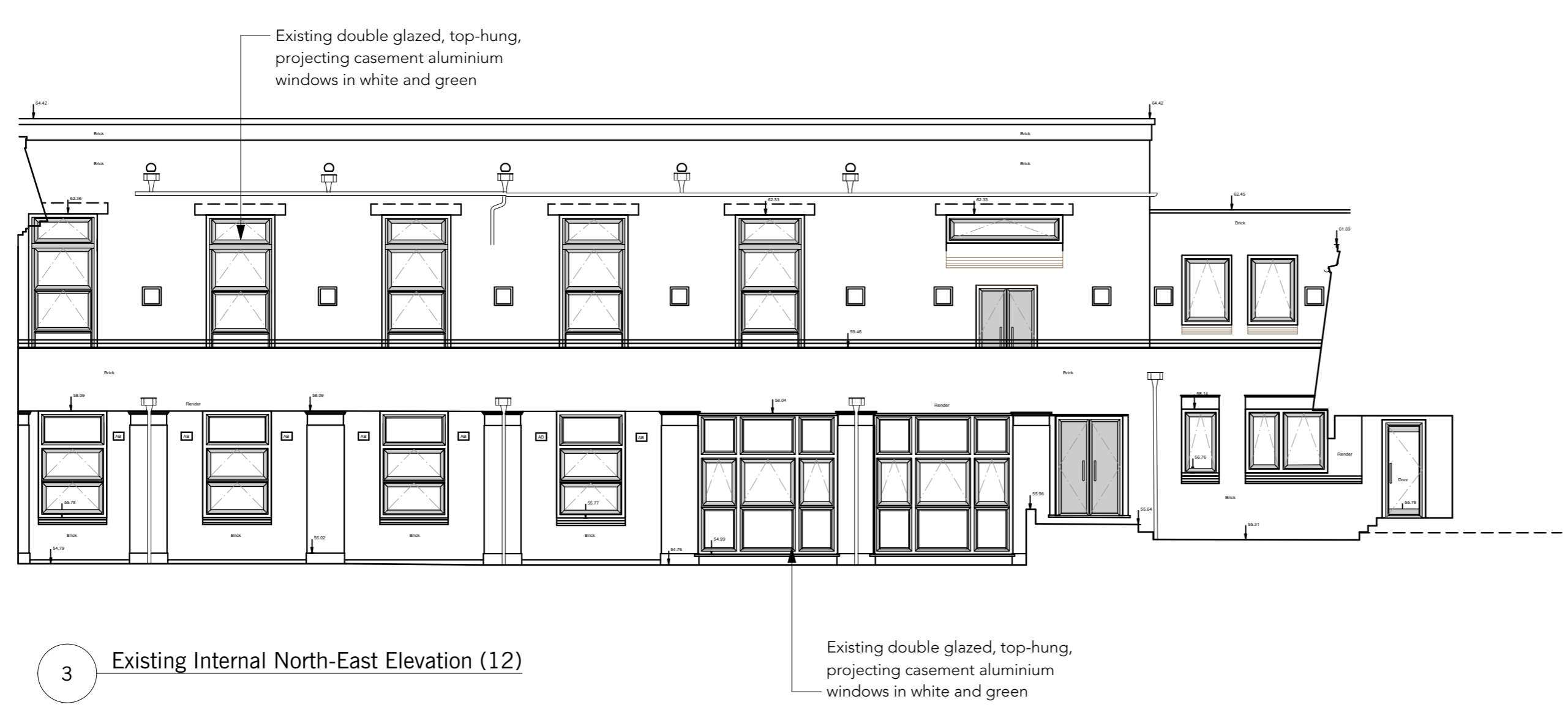
3 Existing Internal North-East Elevation (12)