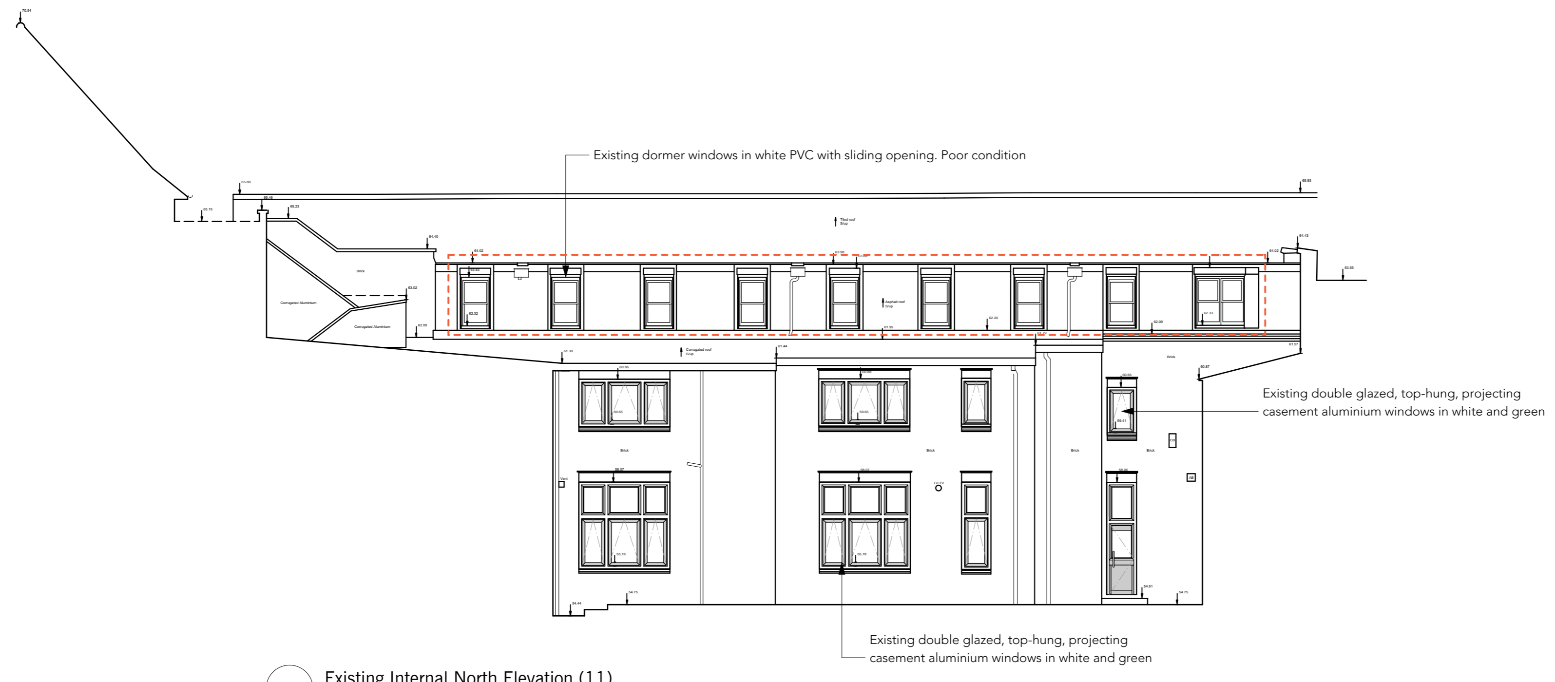
2 Existing Internal North Elevation (11)