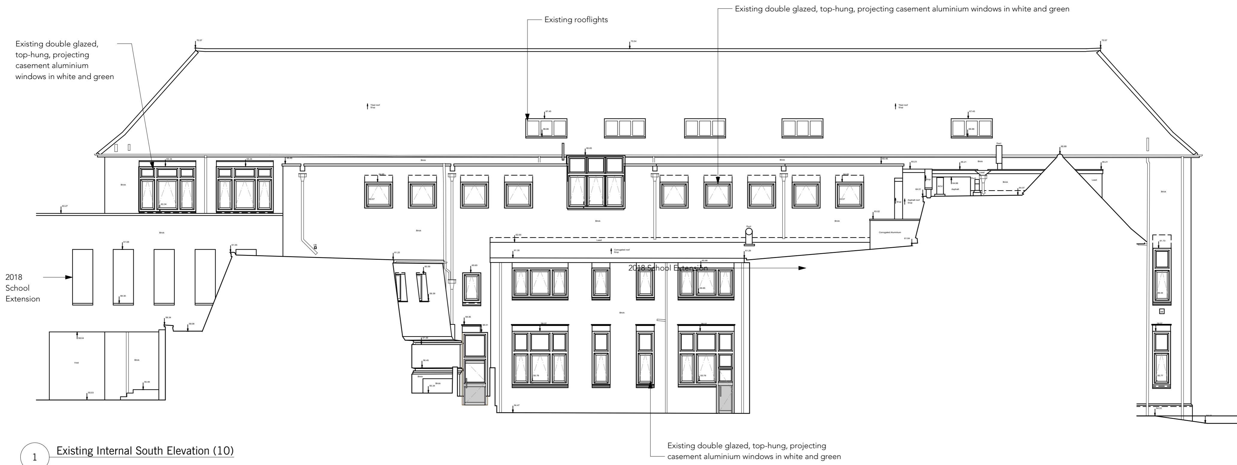
1 Existing Internal South Elevation (10)