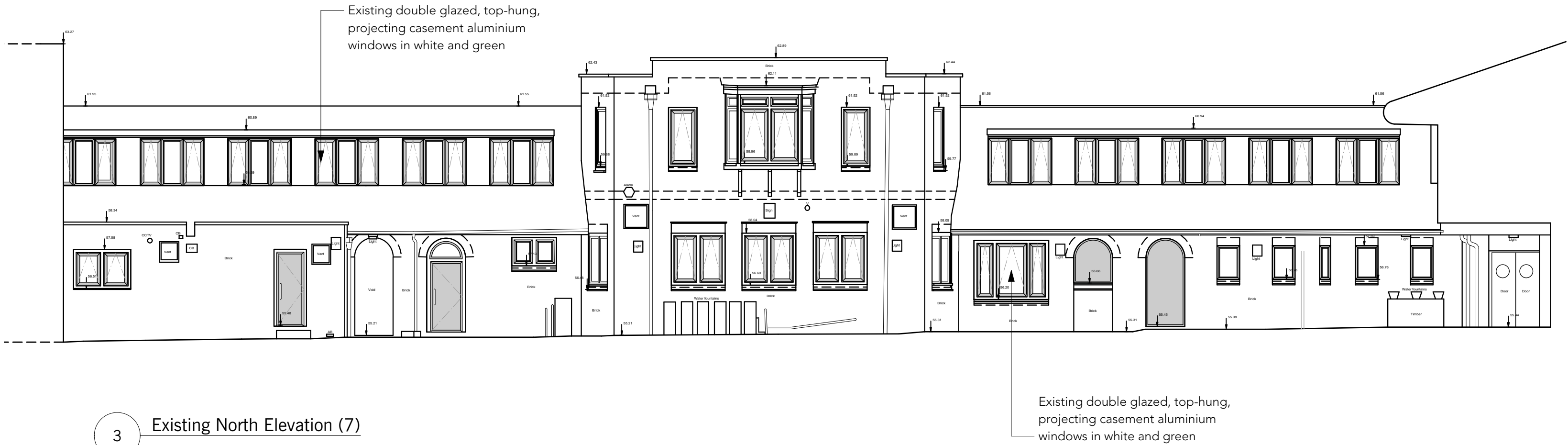
3 Existing North Elevation (7)