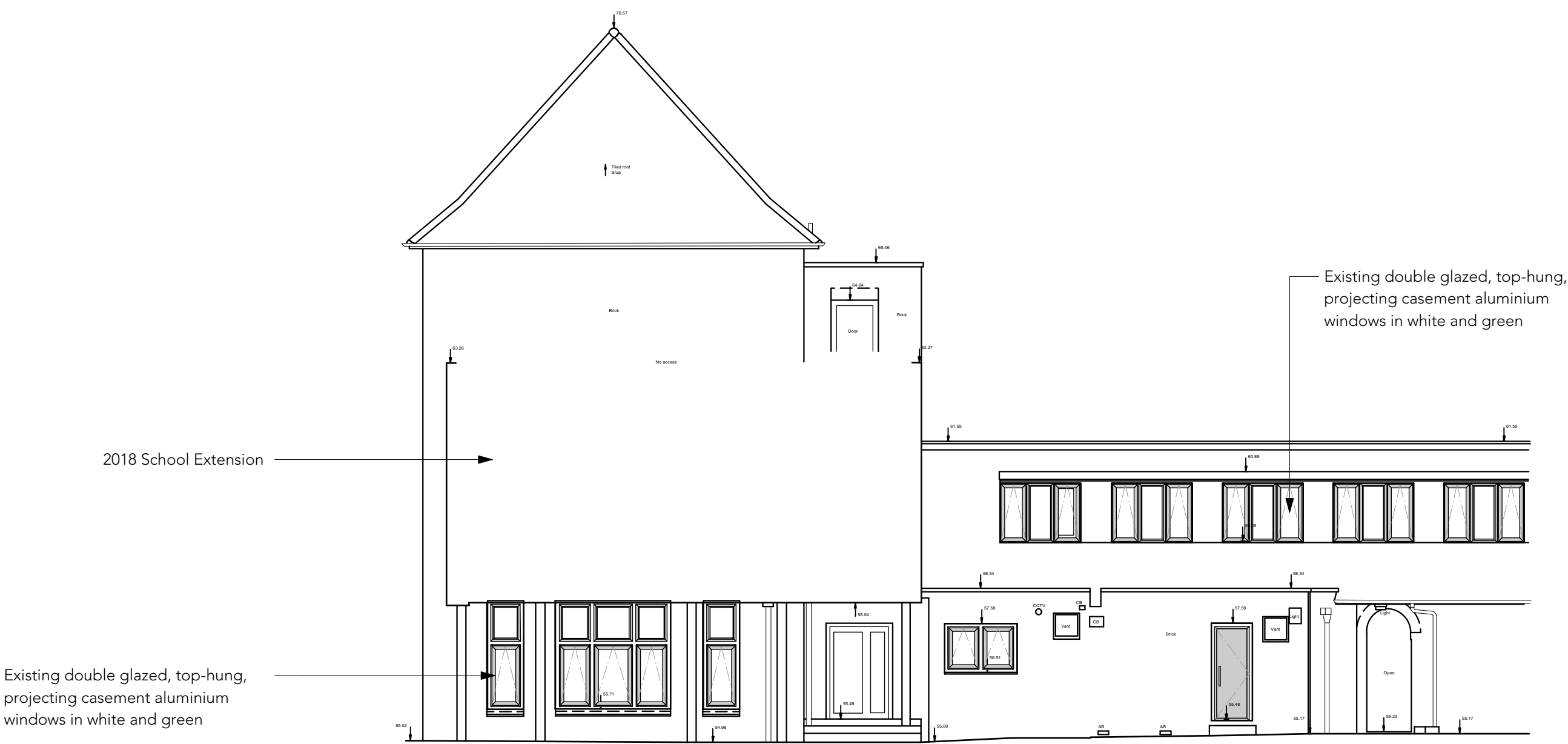
2 Existing North Elevation (6)