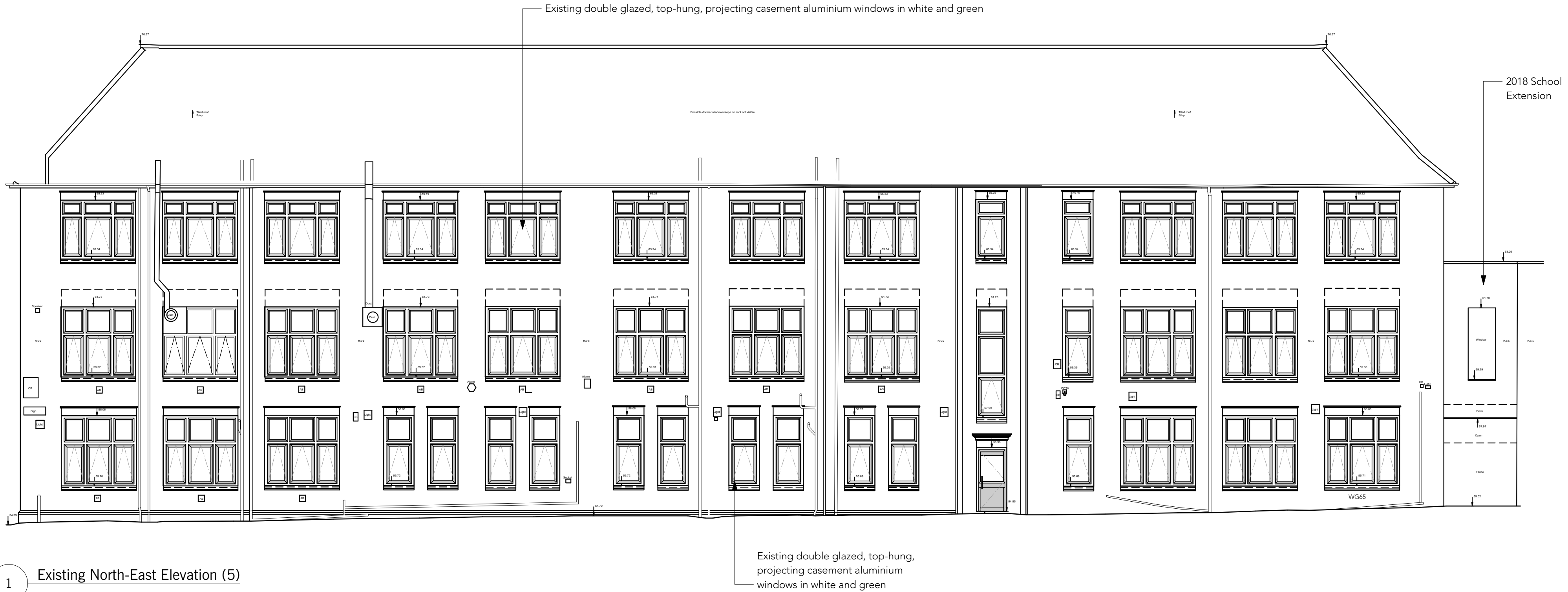
1 Existing North-East Elevation (5)