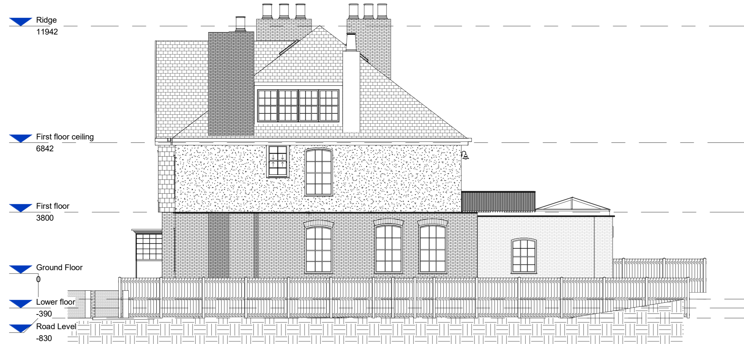
① 1 Proposed Side Elevation 1 : 100

AC DESIGN SOLUTIONS LTD Office 22 Silverbox House East Lane Business Park HA9 7RG 020 8158 4000 WWW.ACDESIGNSOLUTIONS.CO.UK