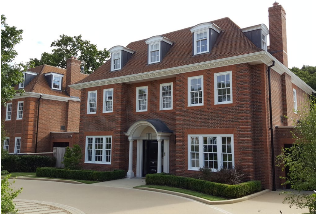
Front drive view