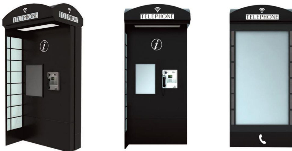
The kiosk design subject of this application

1.2 The proposed replacement would be located on the western side of Tottenham Court Road. Officers measured the footway width at the proposed site as being 9.3m. The kiosk would measure 1096mm (W) x 762mm (L) x 2499mm (H).