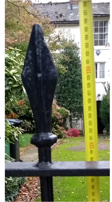
CAST IRON SPEAR HEADS TO EXISTING GATES - THESE WILL BE REPLICATED ON THE NEW METAL FENCE