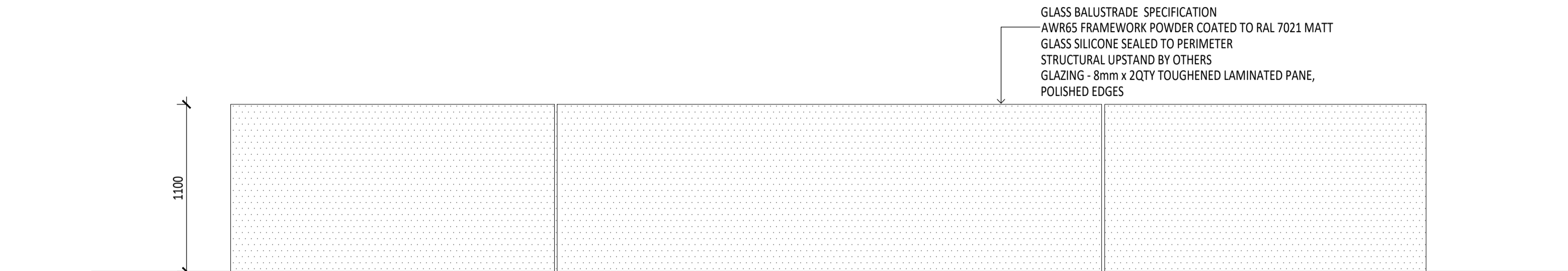
01 FIRST FLOOR BALUSTRADE ELEVATION 1:25 @ A1 & 1:50 @ A3