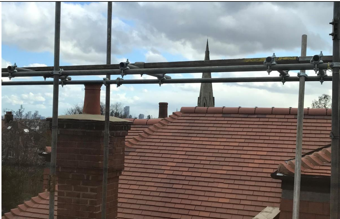
Current view, note only part of the window in the spire is visible and none of the window in the tower.