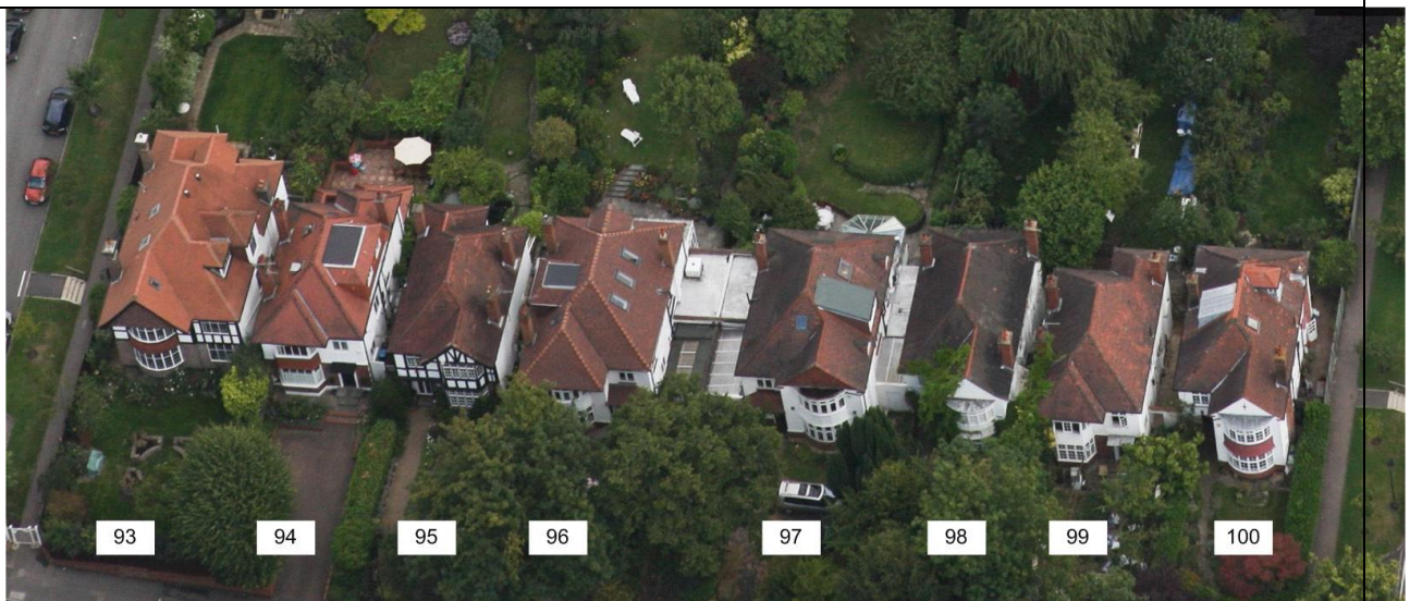
Holly Lodge houses between Langbourne Avenue & Makepeace Avenue