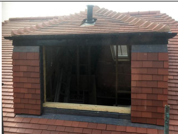
A large (100mm?) pipe projects out of roof Roof < 500mm below ridge Flat part of roof missing

The North Elevation As-Built drawing shows the western wall of the dormer well to the west of the end of the ridge, this isn't the case, they are in line. Has the main ridge been extended or the dormer moved east?