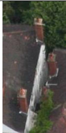
Original south, roof extends to edge of chimney