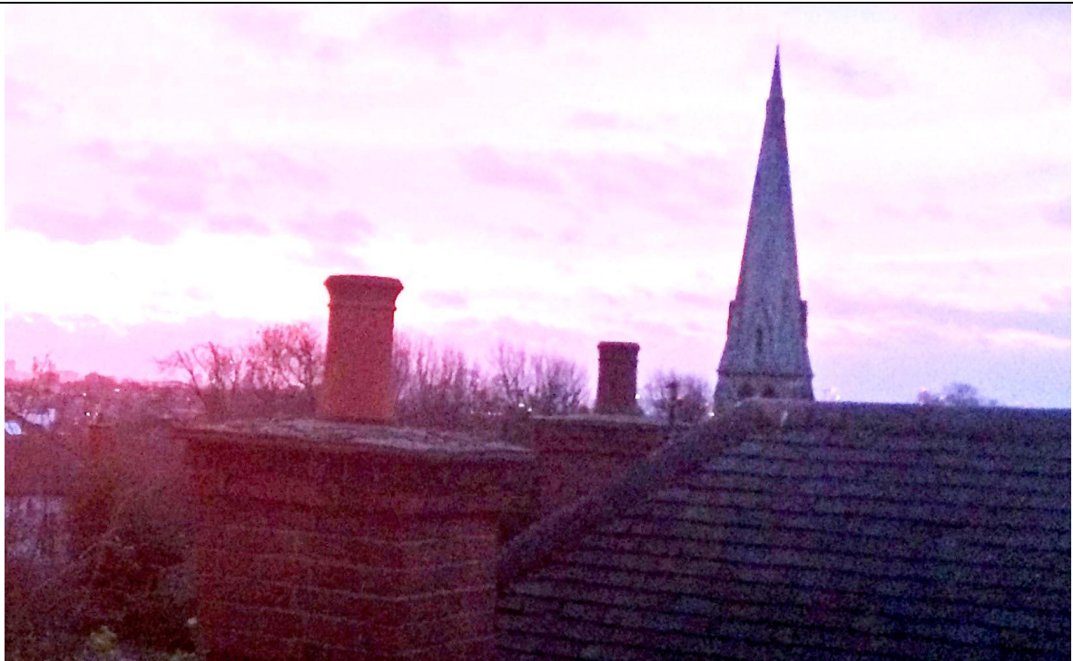
Original view from attic room