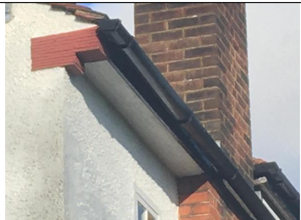
Eaves at 100 HWH, 98 would have been similar