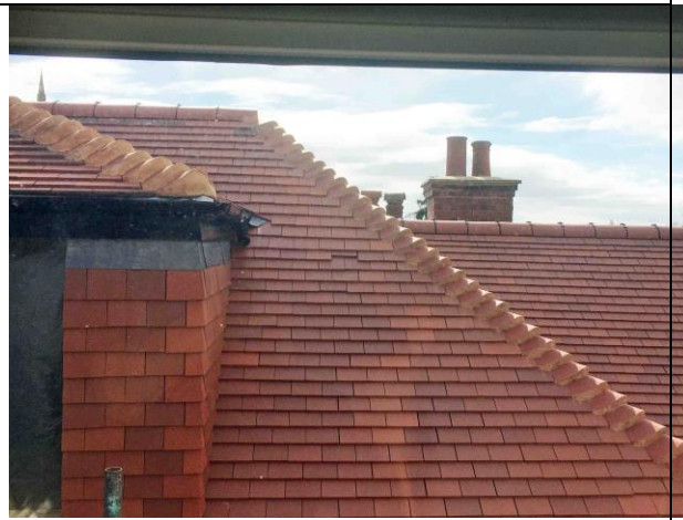
Main roof ridge in line with west side of dormer