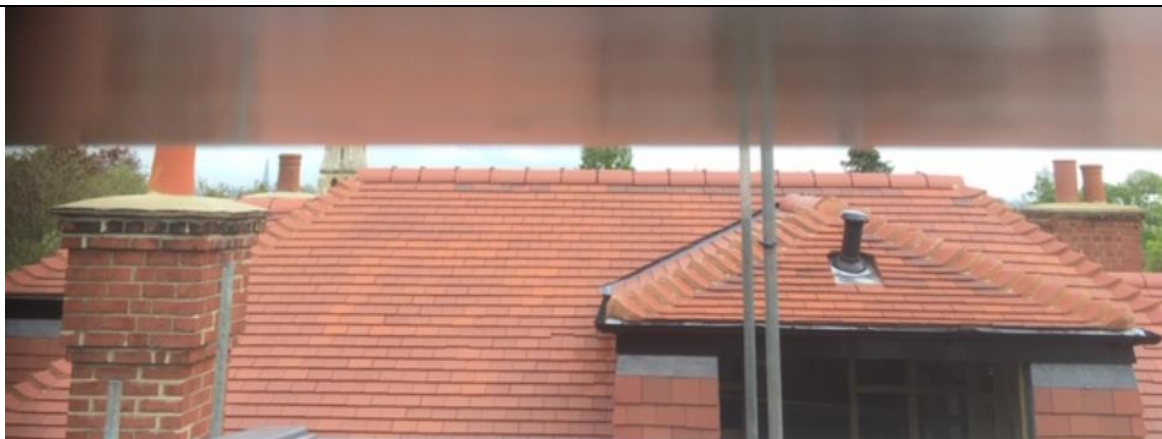
Current view from very top of 97 attic window