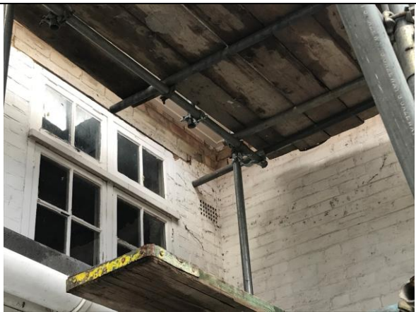
West, note new bricks over window